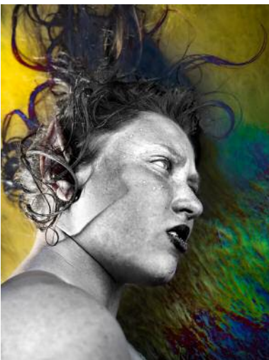
11_