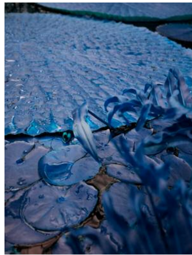
10_