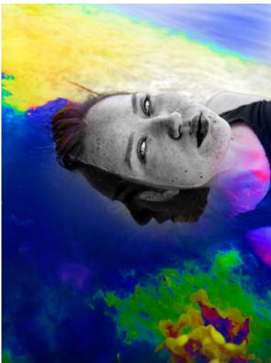
05_