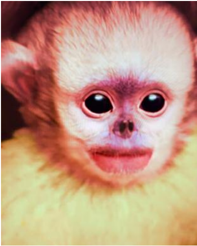
01_