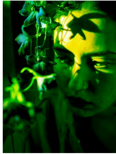
08_