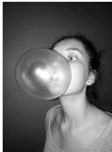
06_