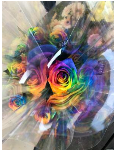
04_