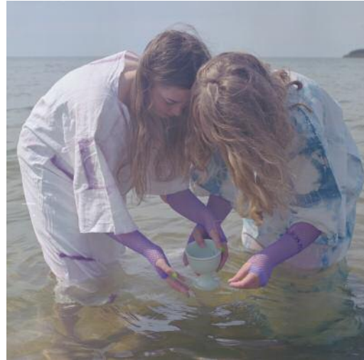
02_