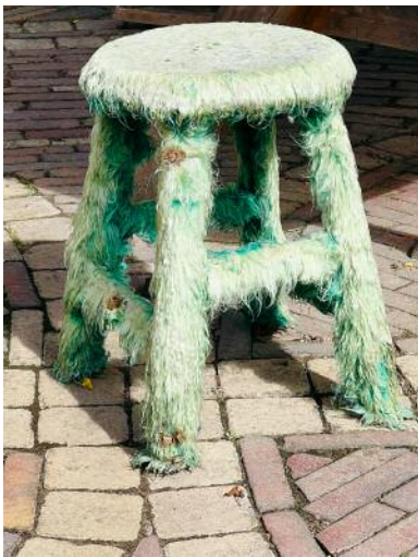
09_