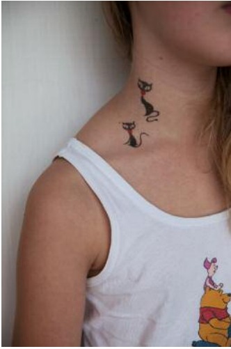
07_