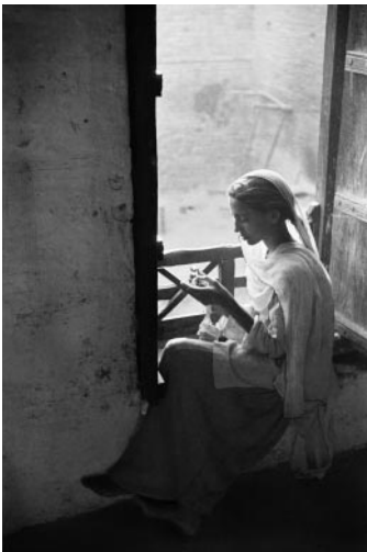
05_ Frank Horvat, Karachi, Pakistan, 1952