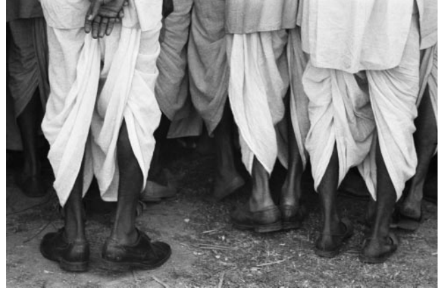
14_Frank Horvat, Calcutta, India, 1962