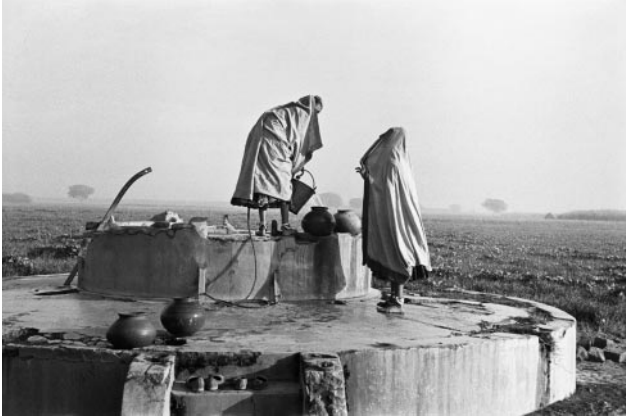
07_ Frank Horvat, Women at a village well, Punjab, India, 1952 © Frank Horvat Studio