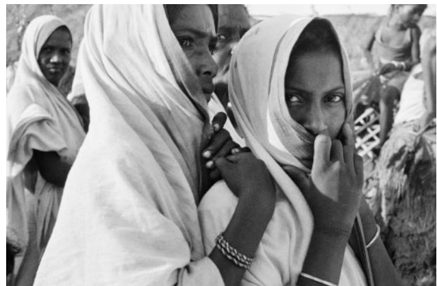
06_ Frank Horvat, Women listening to Vinoba Bhave speech, Bihar, India, 1953