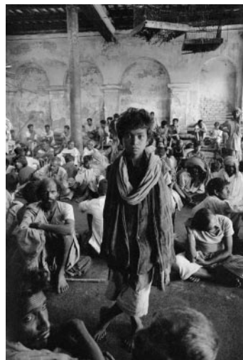
12_ Frank Horvat, Beggar assembly, Calcutta, India, 1962 © Frank Horvat Studio