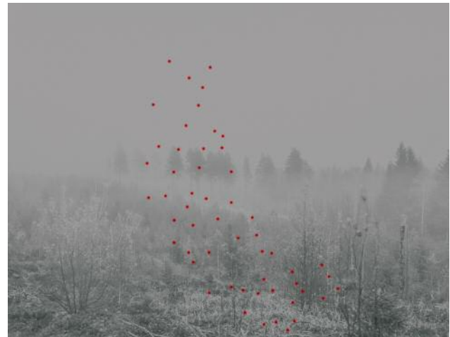
04 54 Different Solutions , 2017 © Jaakko Kahilaniemi