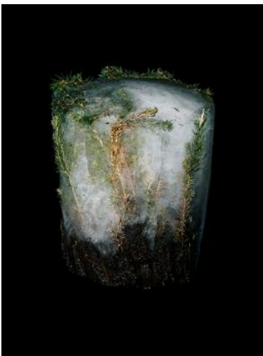
09 Preserving Nature , 2018