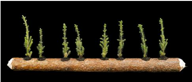
03 Colliding Generations , 2017 © Jaakko Kahilaniemi