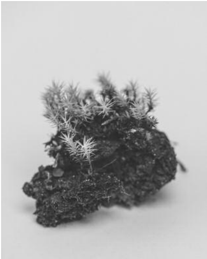
01 54 Grams of Soil from 54 Different Solutions , 2017 © Jaakko Kahilaniemi