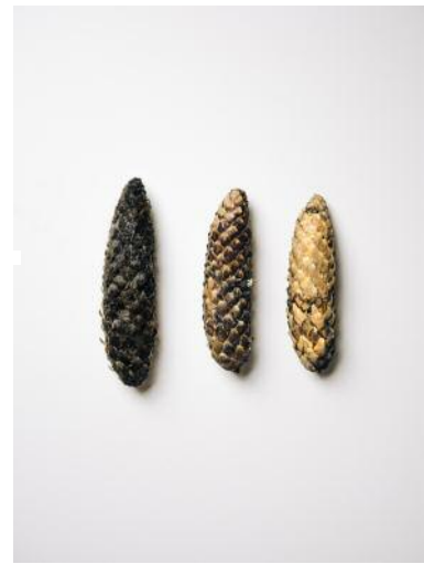
10 Picked Fragments , 2016 © Jaakko Kahilaniemi