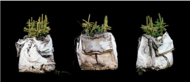
07 Package of Power , 2020