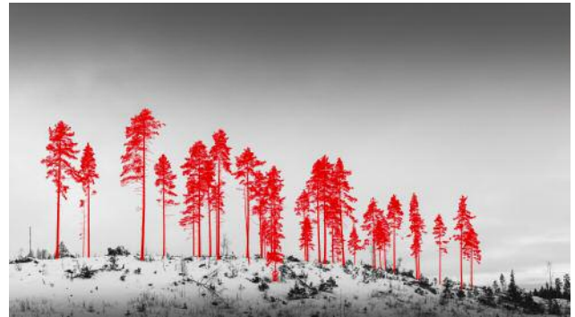
08 Next Possible Victims , 2018