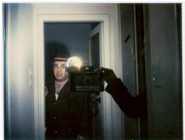
12_