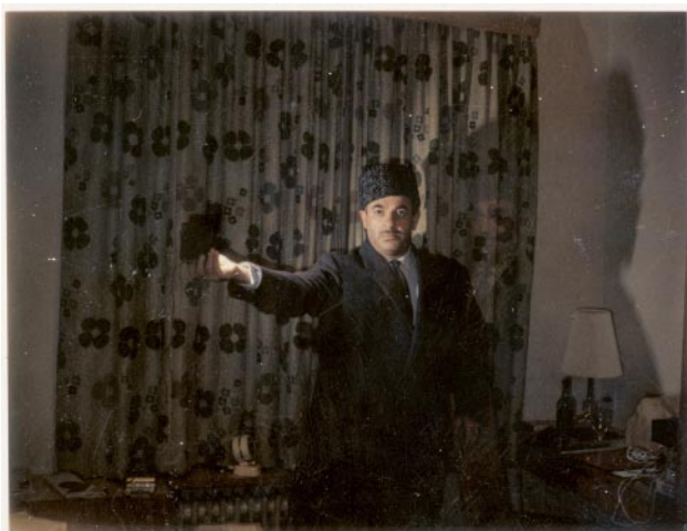
11_