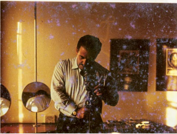
01_