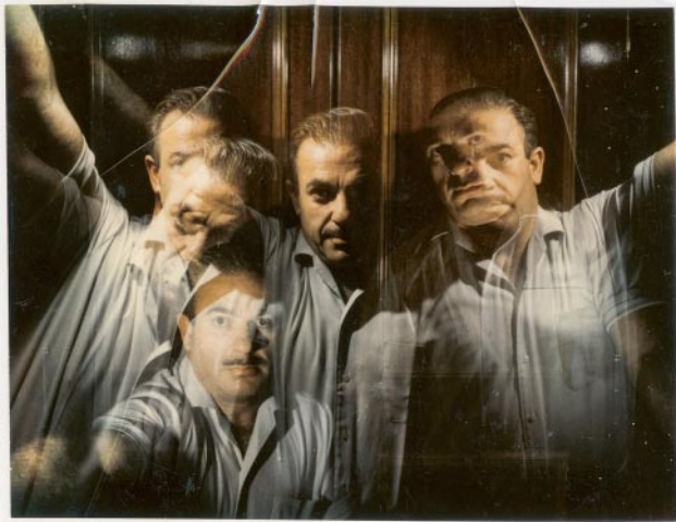
07_