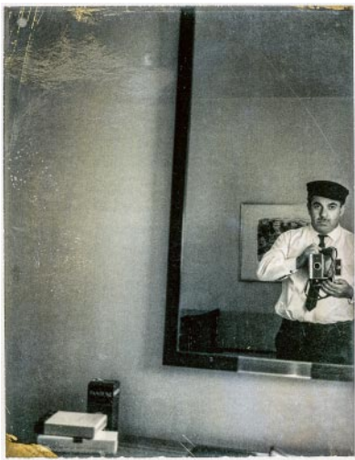
09_