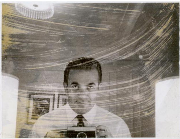
05_