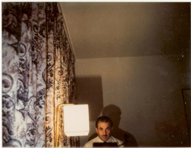
03_