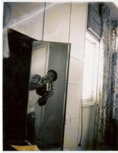
08_