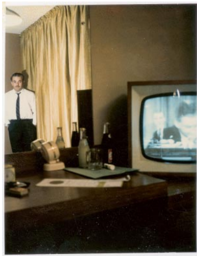
10_