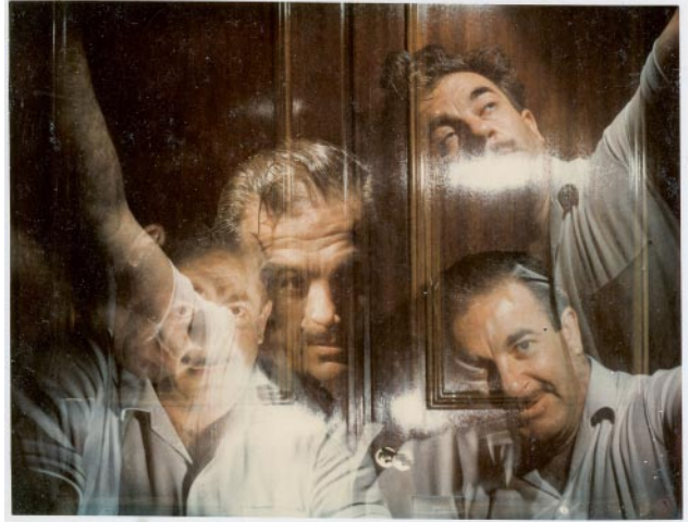
02_