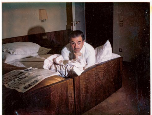
06_