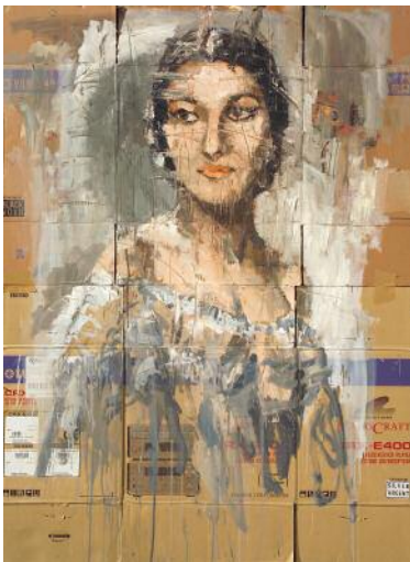
09_Maria Callas, 2004 Oil on cardboard, 133 × 103 cm. Private collection Essen