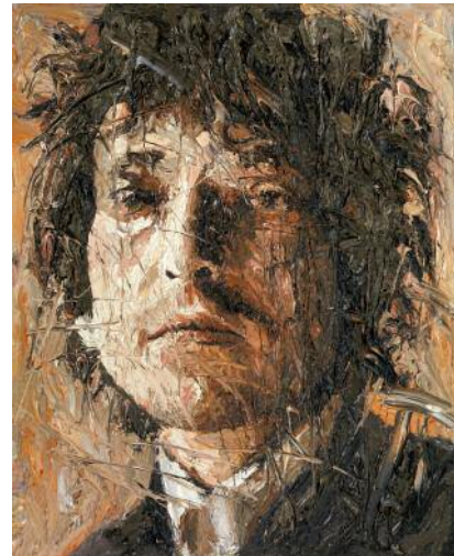
04_Bob Dylan, 2017, Oil on canvas, 105 × 85 cm. Private collection Cologne