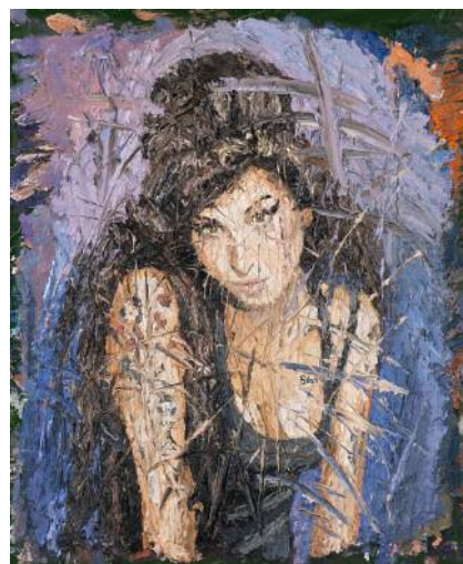
06_Amy Winehouse, 2018 Oil on canvas, 120 × 100 cm. Owned by the artist