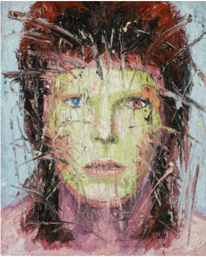
07_David Bowie, 2016 Oil on canvas, 105 × 85 cm. Private collection Wiesbaden