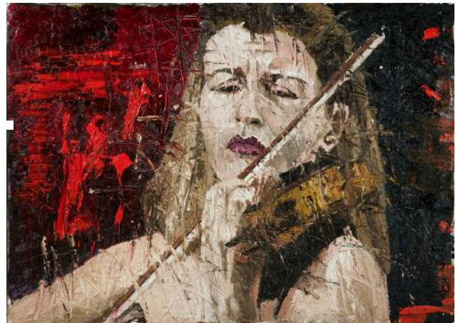
10_Anne-Sophie Mutter, 2006 Oil on canvas, 162 × 228 cm. Private collection Saarland