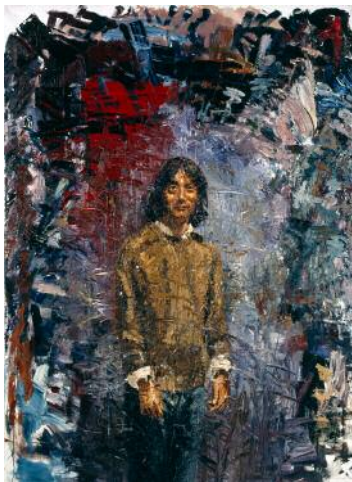
11_Kent Nagano, 2002 Oil on canvas, 228 × 162 cm, Collection Konzerthaus Dortmund – Philharmonie für Westfalen