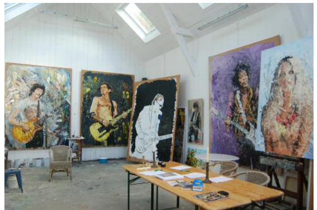
12_Atelier Port Blanc Summer 2014