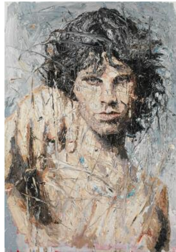
02_Jim Morrison 2016/17 Oil on canvas, 170 x 120 cm. Private collection