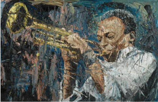
01_Miles Davis, 2021 Oil on canvas, 160 × 250 cm. Owned by the artist