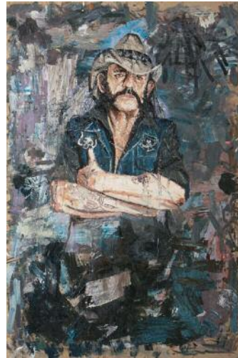
08_Lemmy Kilmister, Motörhead, 2010 Oil on cardboard, 220 × 150 cm. Private collection