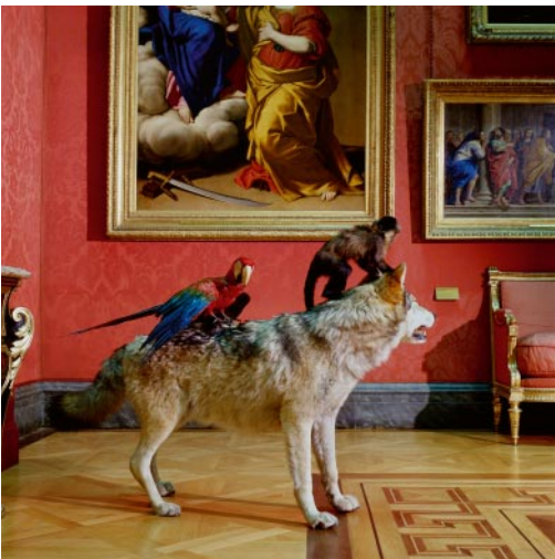
05_ High Art Life after the Deluge Wallace Collection, London, England, 2000 © Karen Knorr