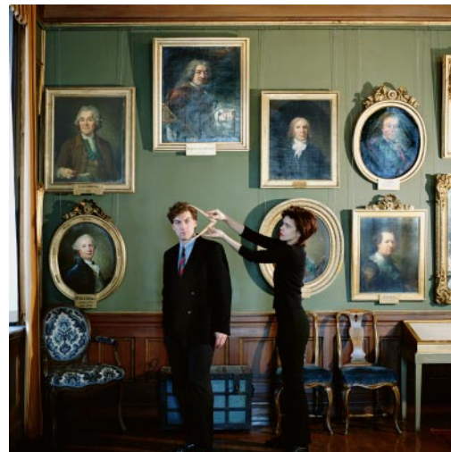
06_ Hårleman's Anatomy Royal Swedish Academy of Fine Arts, Stockholm, Sweden, 1994 © Karen Knorr