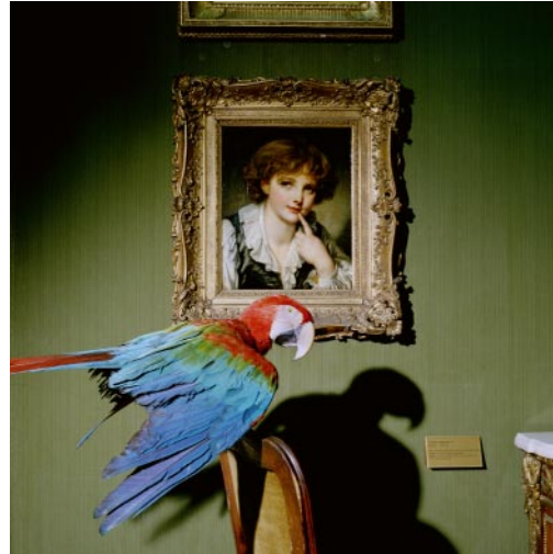
08_ Flaubert's Parrot Wallace Collection, London, England, 2001