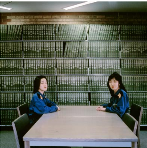
11_ Painters of Modern Life Goldsmiths, London, England, 1997 © Karen Knorr