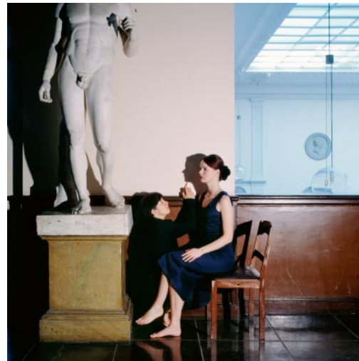
10_ Butade's Daughter Royal Swedish Academy of Fine Arts, Stockholm, Sweden, 1994 © Karen Knorr