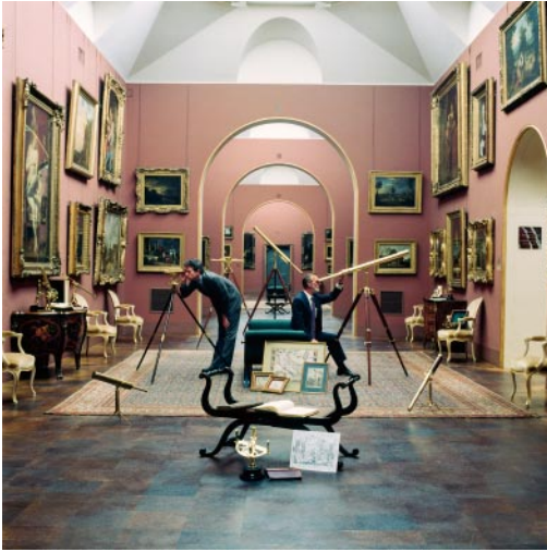
01_ The Analysis of Beauty Dulwich Picture Gallery, London, England, 1988