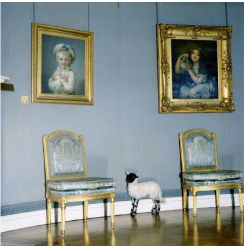
09_ What is Human? Wallace Collection, London, England, 2001 © Karen Knorr