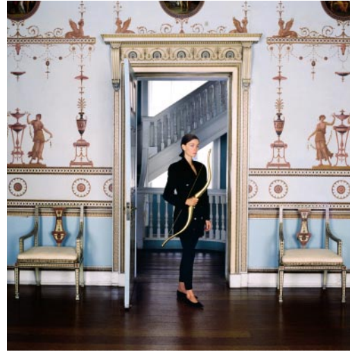
02_ Shattering an Old Dream of Symmetry Osterley Park and House, London, England, 1988 © Karen Knorr