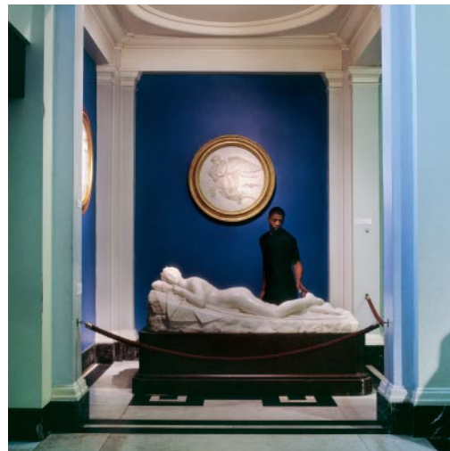
12_ Movement of the Soul Victoria and Albert Museum, London, England, 1994