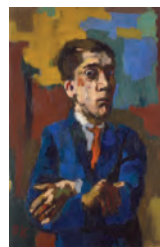
Oskar Kokoschka, Self-Portrait with Crossed Arms, 1923 Oil on canvas, 110 x 70 cm Kunstsammlungen Chemnitz, loan photo: © Kunstsammlungen Chemnitz / PUNCTUM / Bertram Kober © Fondation Oskar Kokoschka / 2018 ProLitteris, Zurich