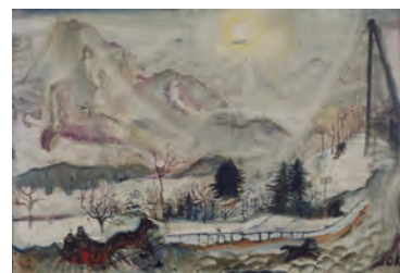
Oskar Kokoschka, Dent(s) du Midi, 1910 Oil on canvas, 79.5 x 115.5 cm Private collection © Fondation Oskar Kokoschka / 2018 ProLitteris, Zurich