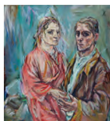
Oskar Kokoschka, Double Portrait of Oskar Kokoschka and Alma Mahler, 1912/1913 Oil on canvas, 100 x 90 cm Museum Folkwang, Essen, photo: Museum Folkwang Essen/Artothek © Fondation Oskar Kokoschka / 2018 ProLitteris, Zurich