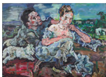
Oskar Kokoschka, Amorous Couple with Cat, 1917 Oil on canvas, 93.5 x 130.5 cm Kunsthau Zürich, 1933 © Fondation Oskar Kokoschka / 2018 ProLitteris, Zurich