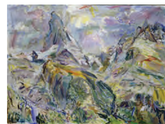
Oskar Kokoschka, Matterhorn II, 1947 Oil on canvas, 90 x 120 cm Private collection Switzerland © Fondation Oskar Kokoschka / 2018 ProLitteris, Zurich