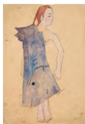
Oskar Kokoschka, Nude Girl with Draped Coat, 1907 Pencil and watercolour on packing paper, 45.4 x 31.6 cm Wienerroither & Kohlbacher, Vienna © Fondation Oskar Kokoschka / 2018 ProLitteris, Zurich