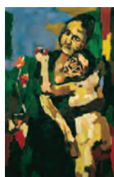
Oskar Kokoschka, Mother and Child Embracing, 1921/1922 Oil on canvas, 121 x 81 cm Belvedere, Wien