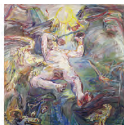
Oskar Kokoschka, The Prometheus Triptych: Hades and Persephone, Apocalypse, Prometheus, 1950 Oil and mixed technique on canvas, Hades and Persephone: 239 x 234 cm / Apocalypse: 239 x 349 cm / Prometheus: 239 x 234 cm The Samuel Courtauld Trust, The Courtauld Gallery, London © Fondation Oskar Kokoschka / 2018 ProLitteris, Zurich