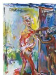
Oskar Kokoschka, Time, Gentlemen Please, 1971/1972 Oil on canvas, 130 x 100 cm Tate: Purchased 1986 © Fondation Oskar Kokoschka / 2018 ProLitteris, Zurich