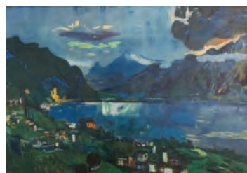
Oskar Kokoschka, Lake Geneva II, 1923 Oil on canvas, 64 x 95 cm Museum Ulm - 1937 vom Reichsministerium beschlagnahmt, 2014 Schenkung in Erinnerung an Paul E. und Gabriele B. Geier © Fondation Oskar Kokoschka / 2018 ProLitteris, Zurich