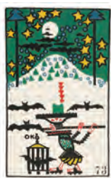
Oskar Kokoschka, Flute Player and Bats (Wiener Werkstätte postcard no. 73), 19067 Colour lithography, 14 x 9 cm Albertina, Wien © Fondation Oskar Kokoschka / 2018 ProLitteris, Zurich