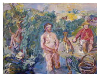
Oskar Kokoschka, Zráni (High Summer), 1938-1940 Oil on canvas, 68.3 x 89.2 cm National Galleries of Scotland, Edinburgh. Presented by the Czechoslovak Government in Exile 1942, © Fondation Oskar Kokoschka / 2018 ProLitteris, Zurich