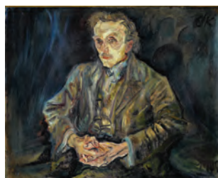
Oskar Kokoschka, Adolf Loos, 1909 Oil on canvas, 74 x 91 cm Staatliche Museen zu Berlin, Nationalgalerie, photo: Roman März © Fondation Oskar Kokoschka / 2018 ProLitteris, Zurich