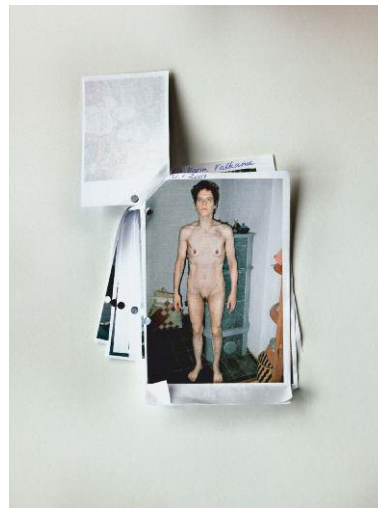
4_Visual Aid ©Karina-Sirkku Kurz