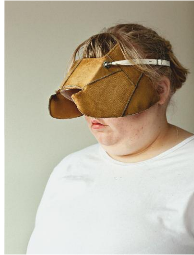
2_The Blinder I