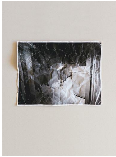
8_An Act of Compensation