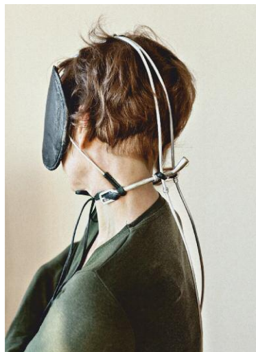
10_The Blinder II