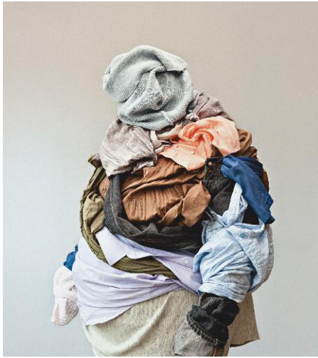
7_ Wrapped in Memories I ©Karina-Sirkku Kurz