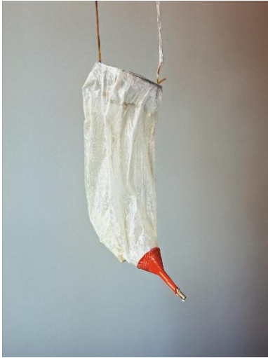
1_The Compensation Utensil ©Karina-Sirkku Kurz