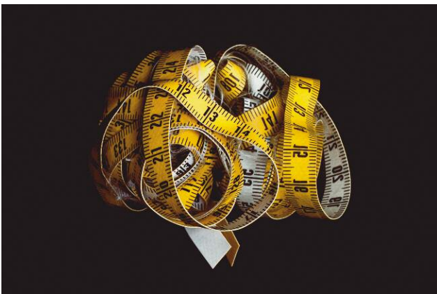
5_The Affirmation Utensil ©Karina-Sirkku Kurz