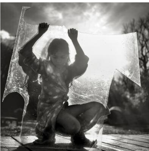
5 © Alain Laboile