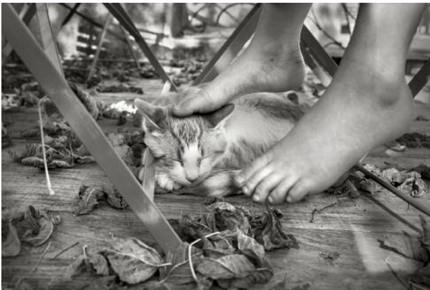
11 © Alain Laboile