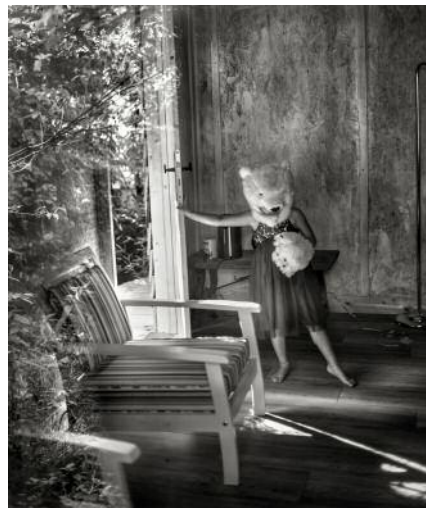
12 © Alain Laboile