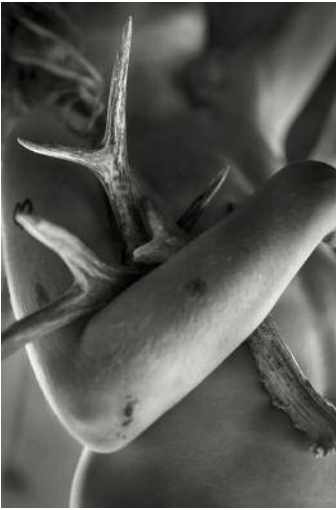
1 © Alain Laboile