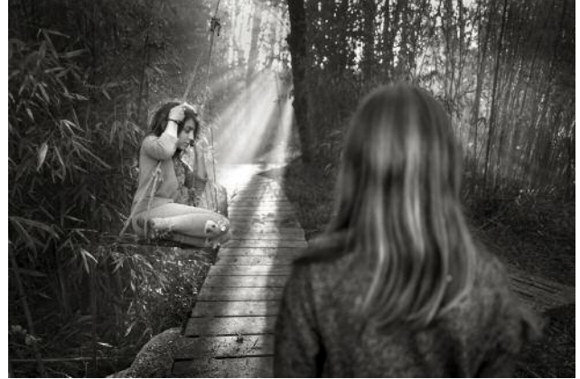
2 © Alain Laboile