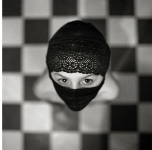
8 © Alain Laboile