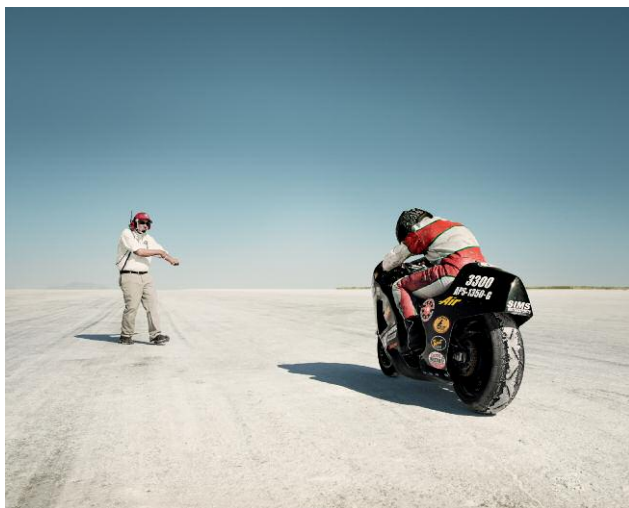
press image 03