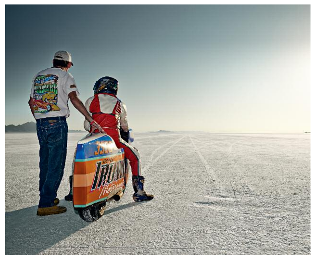
press image 11 © ALEXANDRA LIER