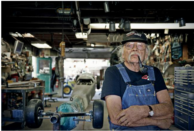
press image 07