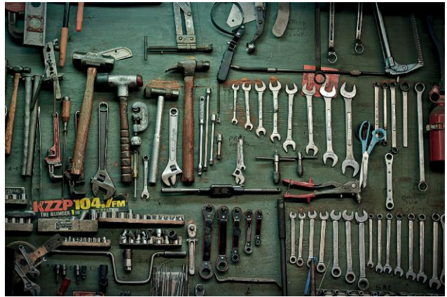
press image 08