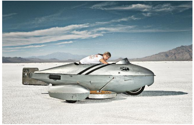
press image 14