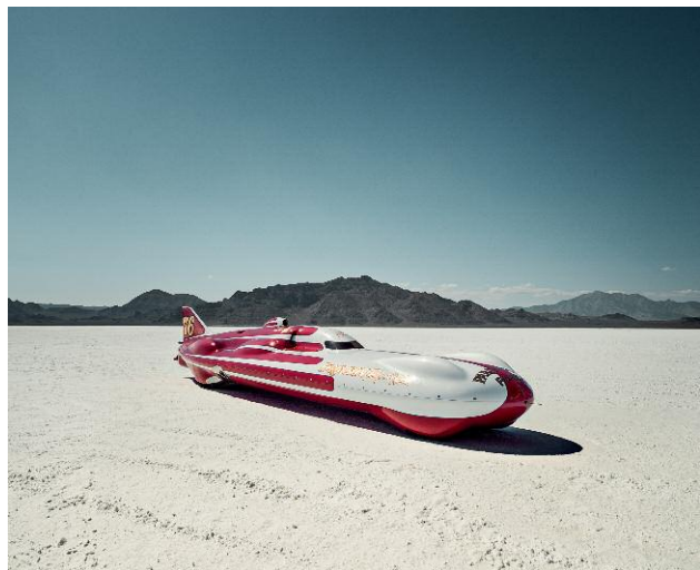
press image 09