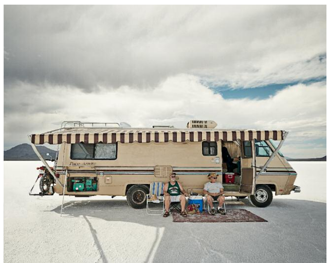
press image 10 © ALEXANDRA LIER