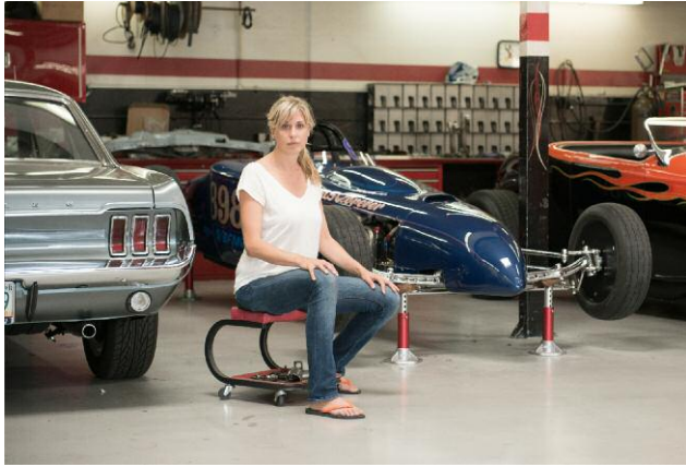
press image 13