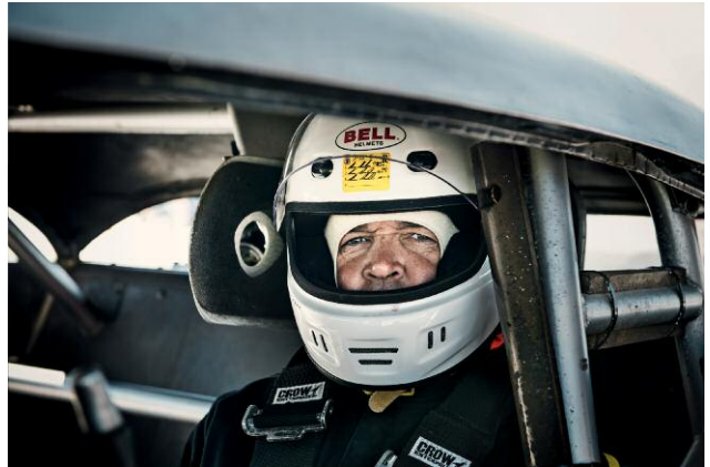
press image 02