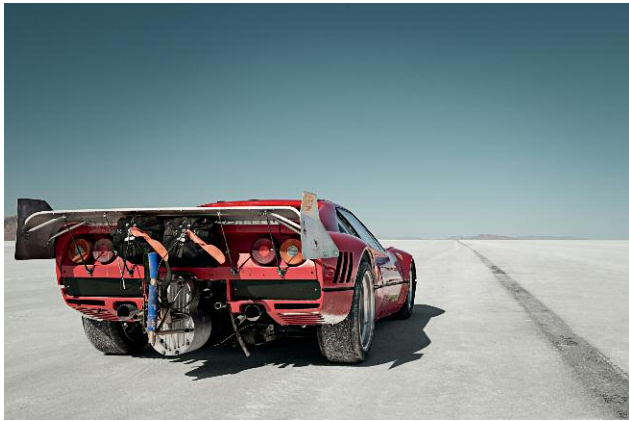
press image 01 © ALEXANDRA LIER