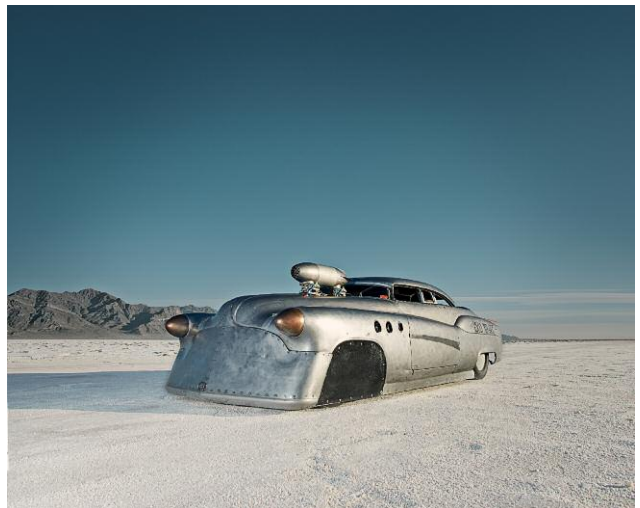
press image 04