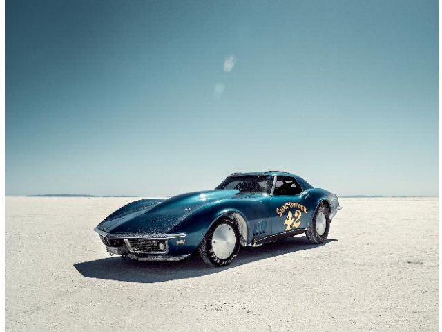
press image 06