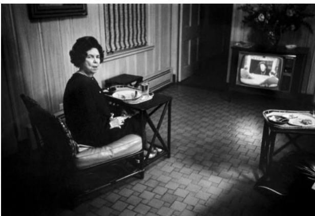
05_ Grandmother Watching TV, 1979