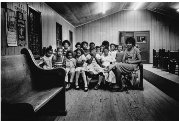
03_ Sunday School, 1980