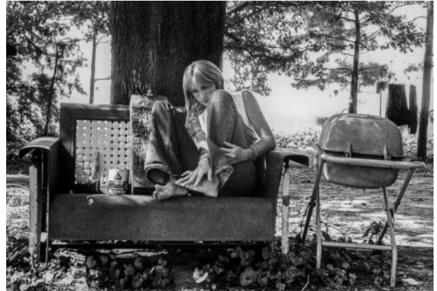
10_ Self-Portrait on Swing at Cully's, 1979