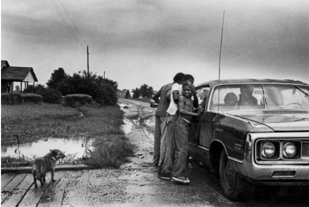
01_ A Humid Day, 1980