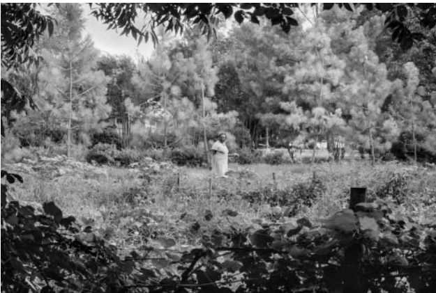
09_ Cully in Garden, 1980 © Lisa McCord