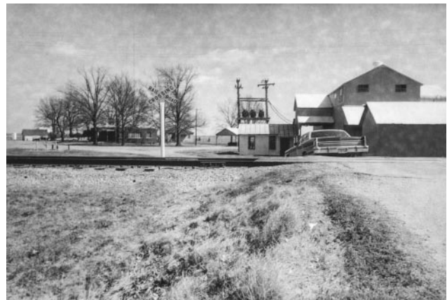
12_ Farm, Railroad Switch, c. 1979