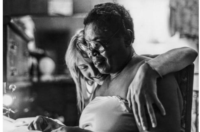
02_ Sewing with Cully, c. 1982