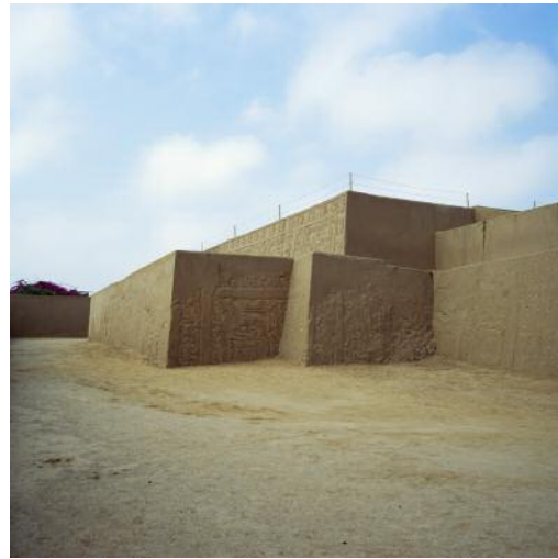
02 Huaca Arco Iris, the Rainbow Pyramid, Trujillo, Peru