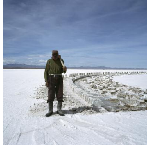
08 Salt Miner, Salar de Uyuni, Bolivia