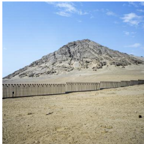
10 Huaca de la Luna, Trujillo, Peru