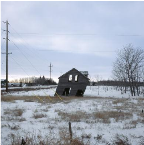
01 Provincial Trunk Highway, Riverton, Manitoba