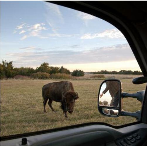
07 Deer Time Ranch, Perkins, Oklahoma