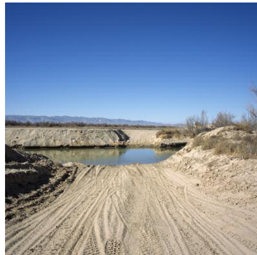
12 Rio Grande, US/Mexico Border, Texas