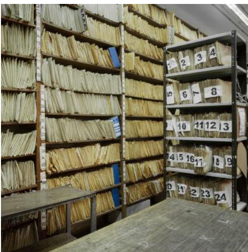
05 Department of Records, Montevideo, Uruguay