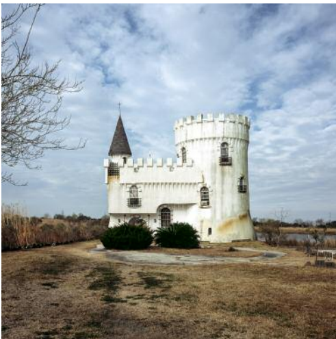
09 Fisherman's Castle, Irish Bayou, Louisiana