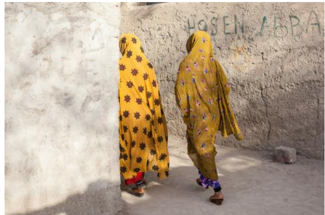
04_Khaje-Ata, Bandar Abbas © Mahdi Ehsaei