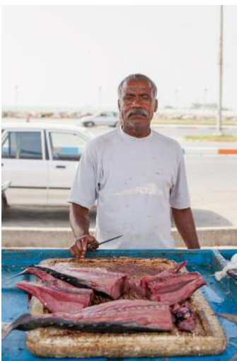
05_Zaker / Fish market, Bandar Abbas