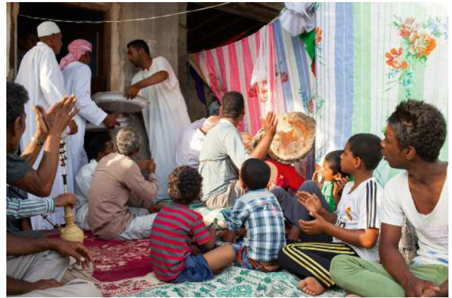
08_Zar ceremony, Tiab