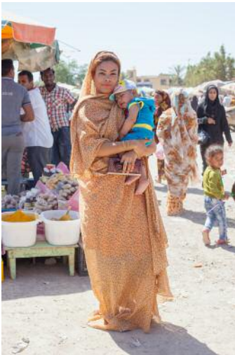
03_Sanaz / Thursday market, Minab