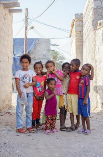
7_Khaje-Ata, Bandar Abbas © Mahdi Ehsaei