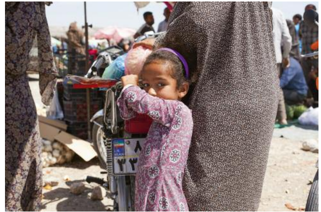
10_Thursday Market / Minab