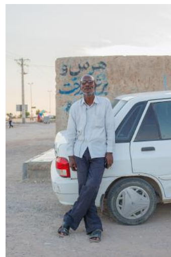
06_Eshagh / Khaje-Ata, Bandar Abbas