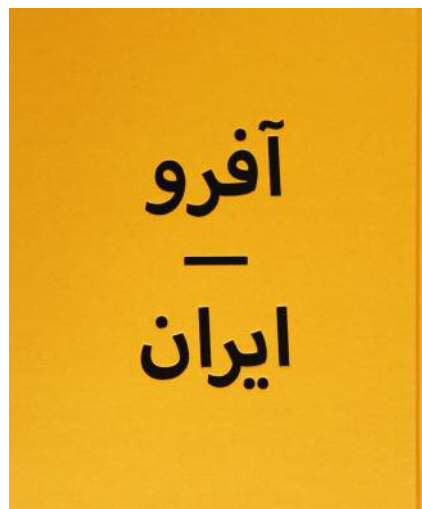
12_Book Afro-Iran, back cover