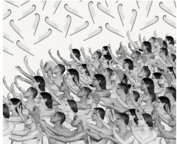
2_Jubilant masses (scene from Soft Power)