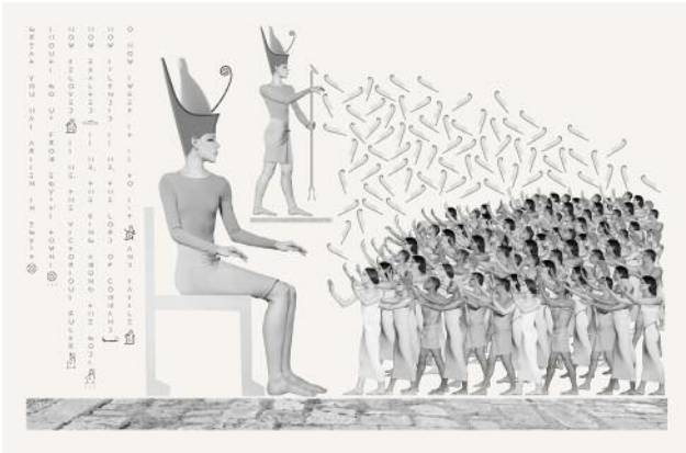
1_Photographic relief: Soft Power © Marc Erwin Babej