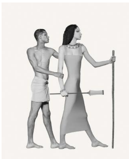
11_Figures: Couple Embracing © Marc Erwin Babej