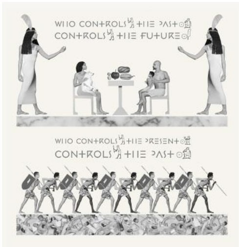
3_Photographic relief: Law and Order © Marc Erwin Babej