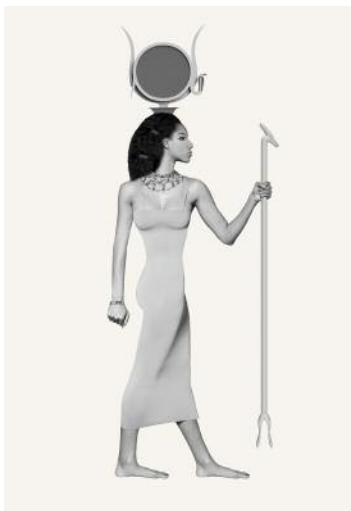
9_Figure: Hathor © Marc Erwin Babej