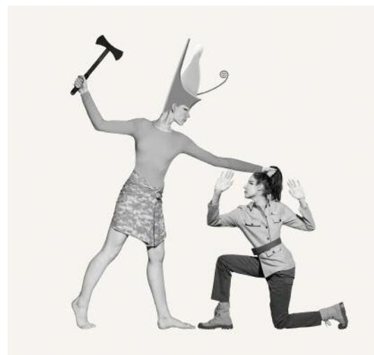
12_Smiting the enemy (scene from the relief Hard Power) © Marc Erwin Babej