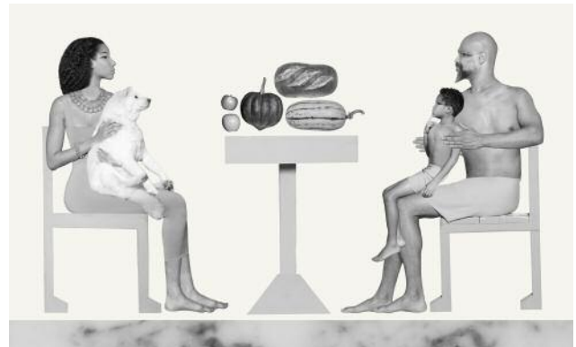
4_Family idyll (scene from Law and Order) © Marc Erwin Babej