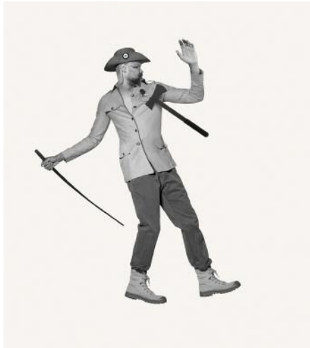
7_Figure: Wounded Enemy