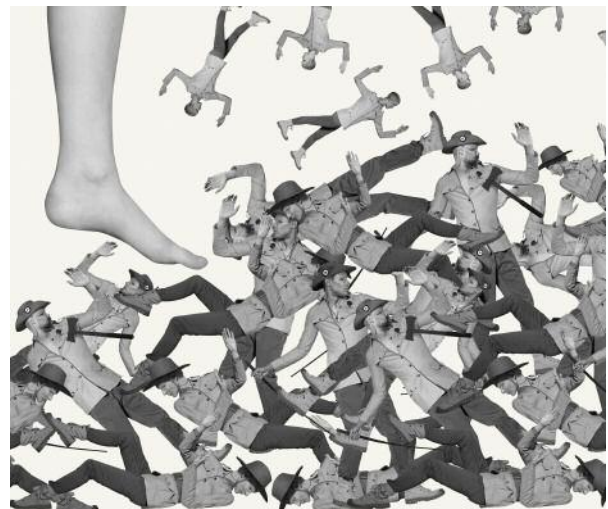
6_Trampling (scene from the relief Hard Power) © Marc Erwin Babej