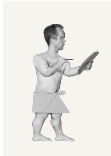
8_Figure: Scribe © Marc Erwin Babej