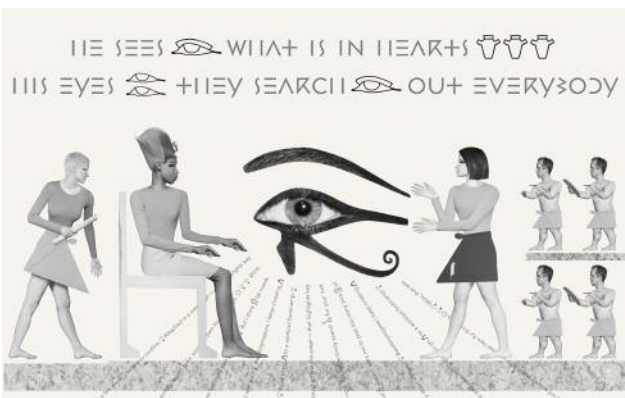
5_The king and his vizier (scene from the relief Horus is Watching You) © Marc Erwin Babej