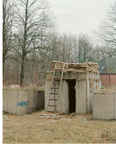
10_Displaced Persons Camp Bergen-Belsen, exterior