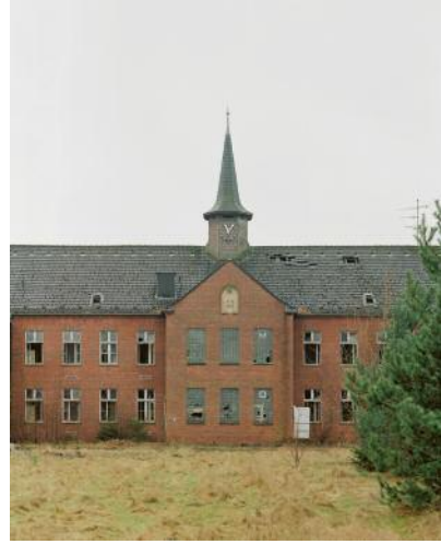
08_Glyn Hughes Hospital