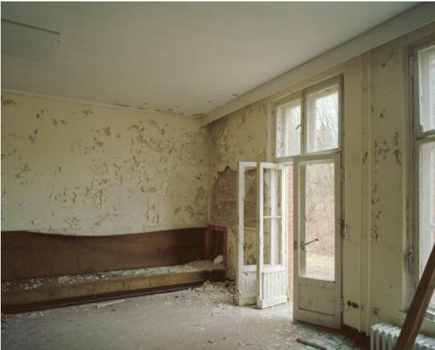
09_Glyn Hughes Hospital, interior