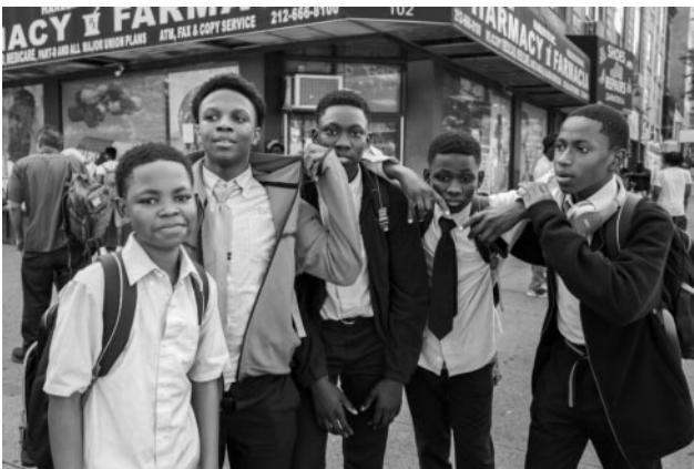
03_