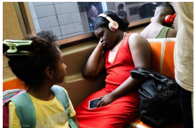
06_