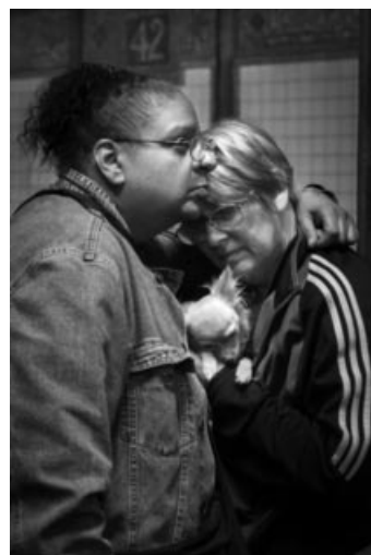
12_