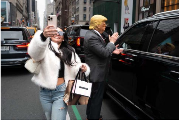
07_