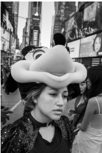
09_