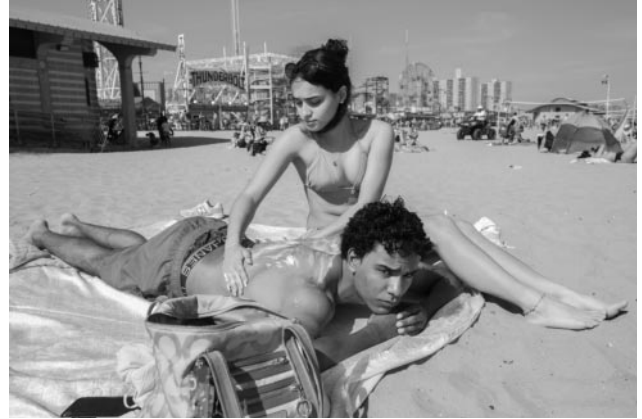
08_