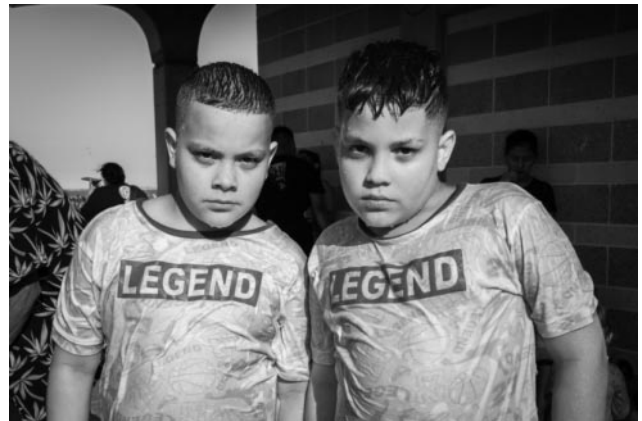
10_