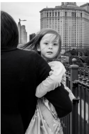
11_