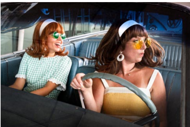
05_