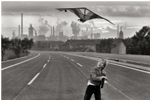
03 Autobahn 42 vor der Freigabe, August-Thyssen-Hütte, Duisburg- Bruckhausen, 1979