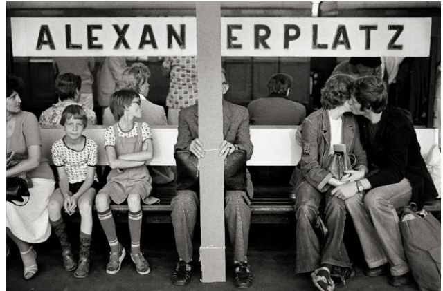
02 S-Bahnsteig Alexanderplatz, Berlin-Mitte, 1980