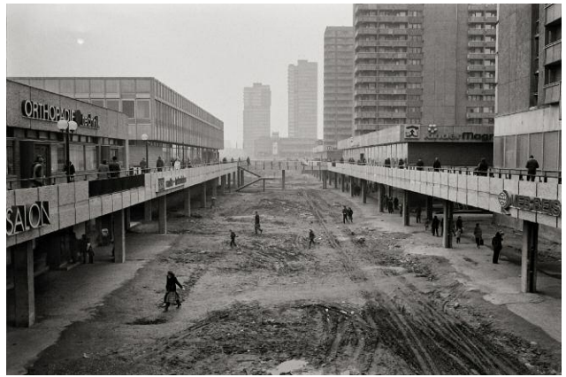
08 Versorgungseinrichtungen im Wohnkomplex IV, Halle-Neustadt, 1983