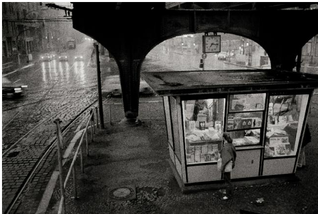
09 Schönhauser Allee Ecke Dimitroffstraße, Berlin-Prenzlauer Berg, 1984