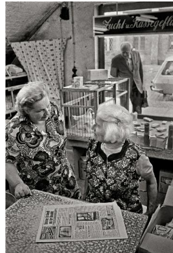
06 „Kleine Markthalle“, Dircksenstrasse, Alexanderplatz, Berlin-Mitte, 1980