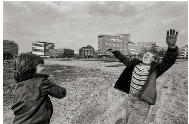
04 Möckernstraße Ecke Hallesche Straße, Gelände des ehemaligen Anhalter Bahnhofs, Kreuzberg, West-Berlin, 1980