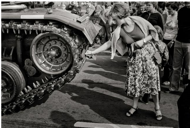
11 Straße des 17. Juni am Großen Stern, Tag der Streitkräfte, Tiergarten, West-Berlin, 1980