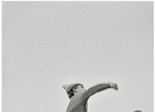
10 Wildstraße, Essen-Vogelheim, 1977