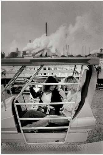
07 Kirmesplatz am Beeckbach, vor der August-Thyssen-Hütte Duisburg-Bruckhausen, Duisburg-Beeck, 1979