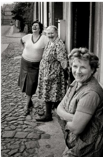
05 Grüne Straße, Wernigerode, 1980