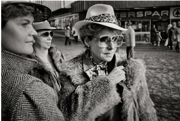
01 Rathaus Center, Essen 1985