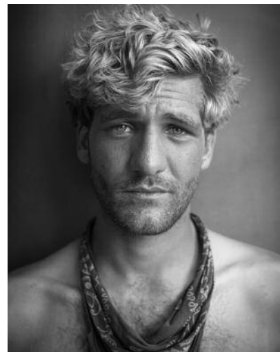
12_Shameless