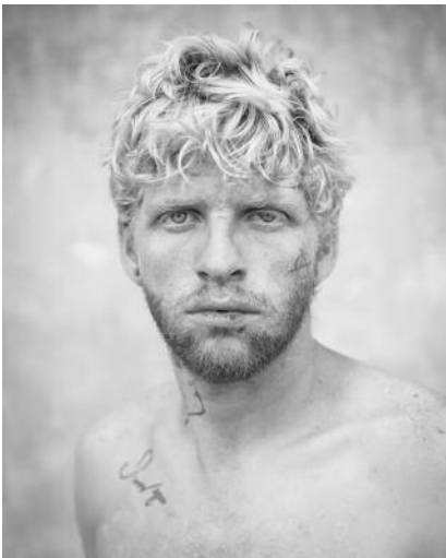
09_Lost Boy