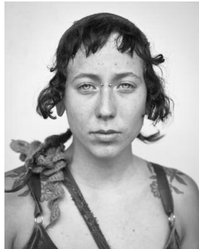
04_Blue Eyes