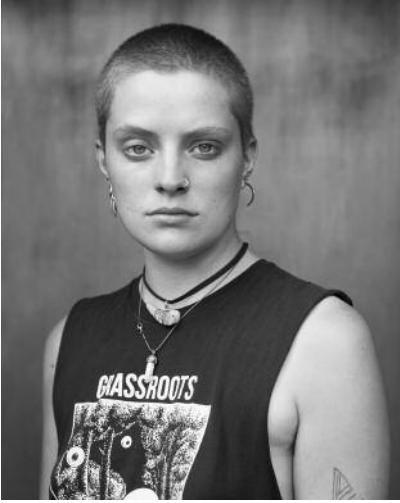
07_Eramis