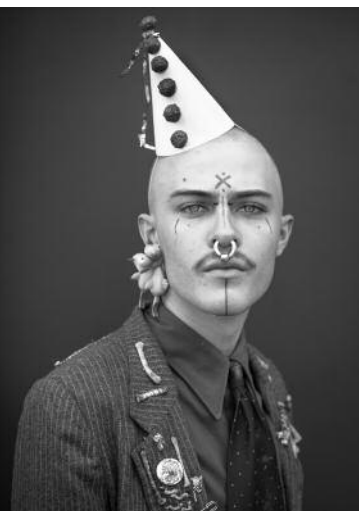
05_Brillo