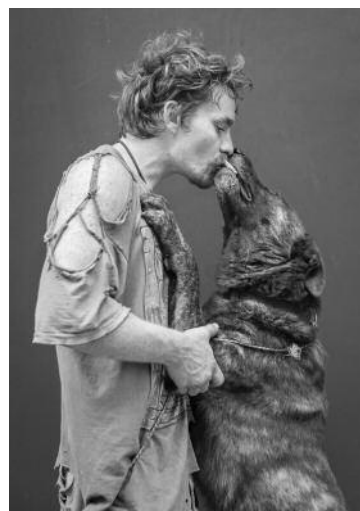
06_Casper and Knugget