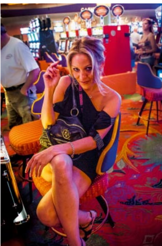
11_