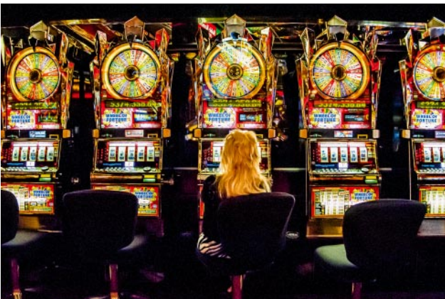
03_