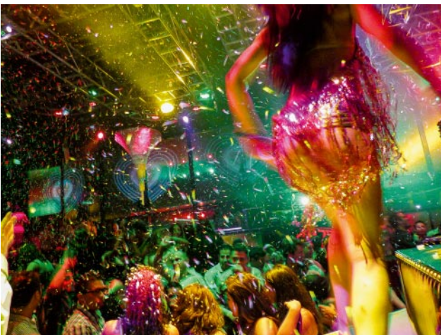
05_