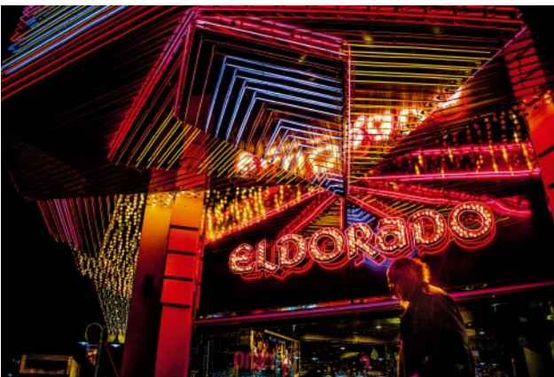
09_