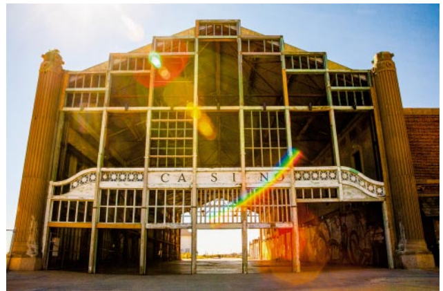
04_