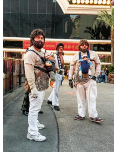
08_