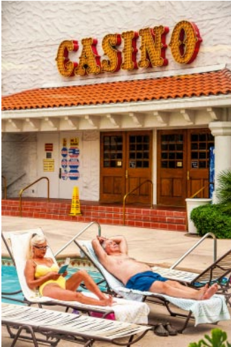
01_