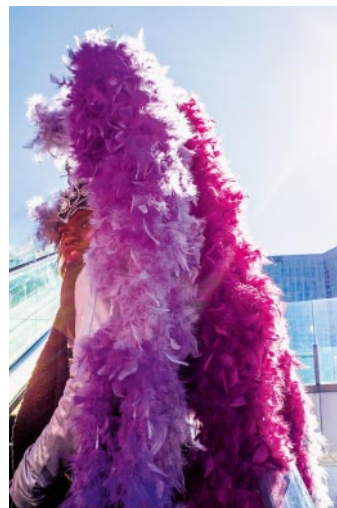
10_