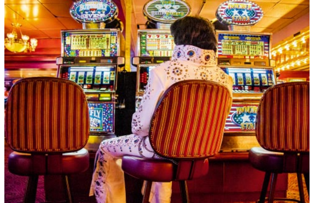
02_