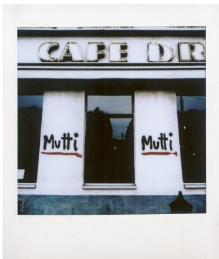
09_Instax4626 © Michaela Spiegel