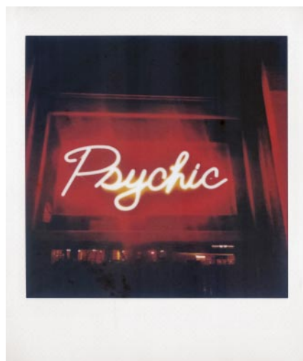
11_Instax0162 © Michaela Spiegel