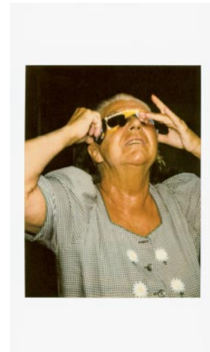
06_pol III5_3/12 © Michaela Spiegel