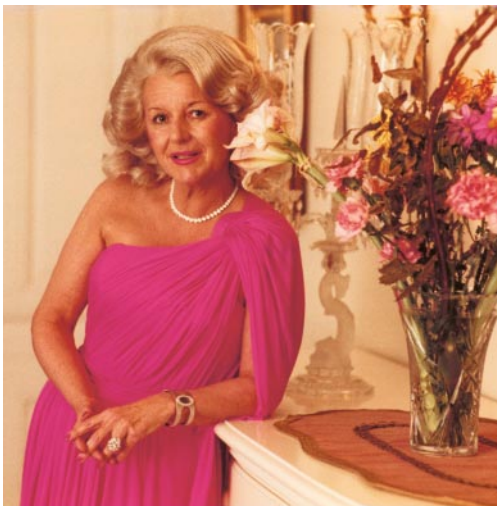
03_Vienna, ca 1979 © Michaela Spiegel