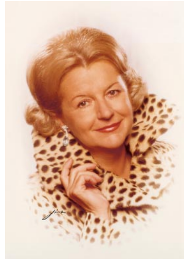
08_Vienna, ca 1969 © Michaela Spiegel