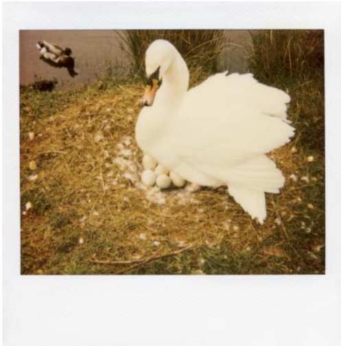
01_Instax0207 © Michaela Spiegel