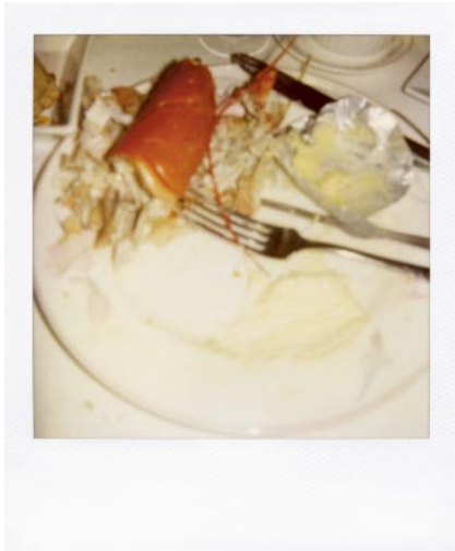
07_pol 9.031 © Michaela Spiegel