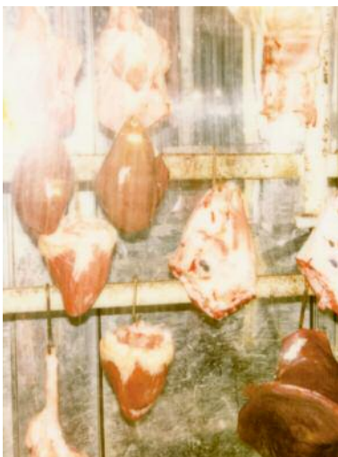
11_Istanbul, 2000 V11_1/1