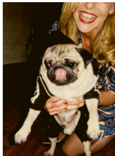
10_Paris, 2006 pol 1.091/1