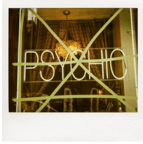
04_New York, 2011 pol 12.028/1 © Michaela Spiegel