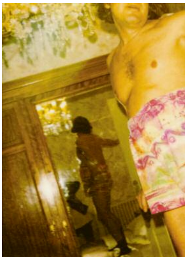
03_Deauville, 1994 120_2/2