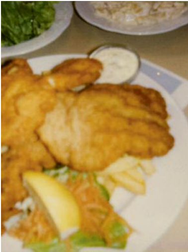
01_Vienna, 2007 pol 3.049 © Michaela Spiegel