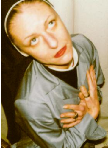
07_Vienna, 2001 V24_2/1