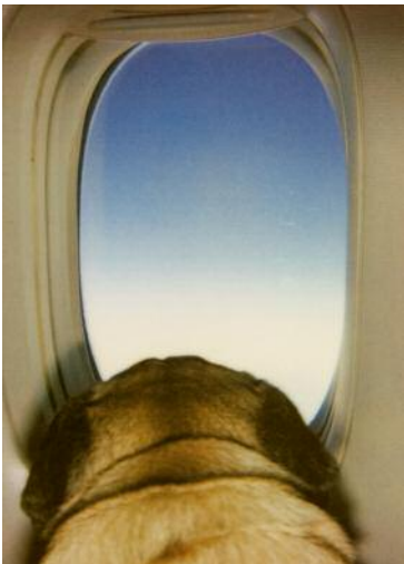
09_Sky High, 2011 pol 11.006/3 © Michaela Spiegel