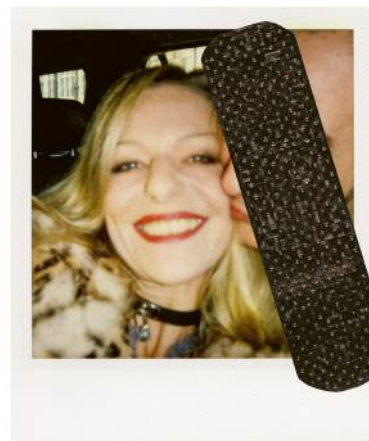
12_Paris, 2007 pol 3.007/4 293