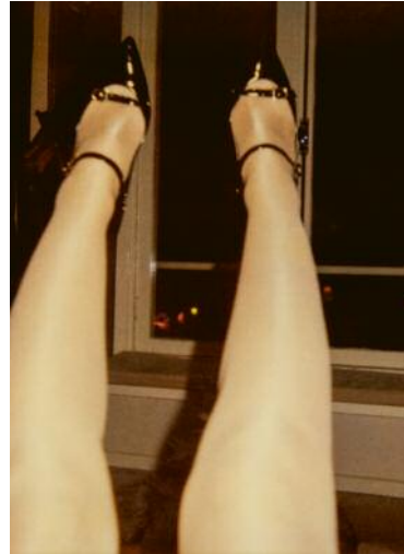
02_Amsterdam, New Year's Eve 2009 pol 6.103/3