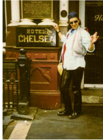
08_New York, 1995 1995.227