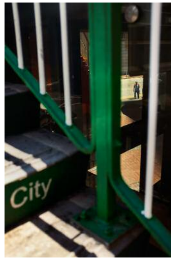
10 © Mikko Takkunen