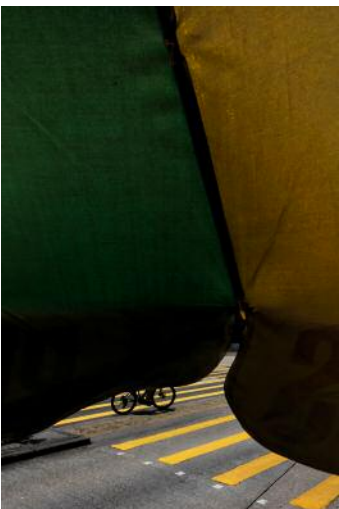
11 © Mikko Takkunen