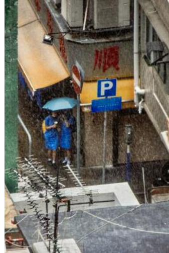
02 © Mikko Takkunen