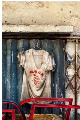
12 © Mikko Takkunen