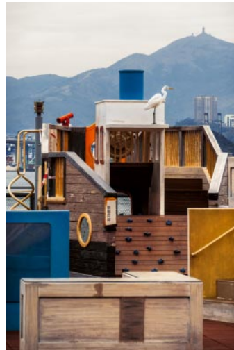
04 © Mikko Takkunen