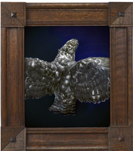
5 © Oliver Mark