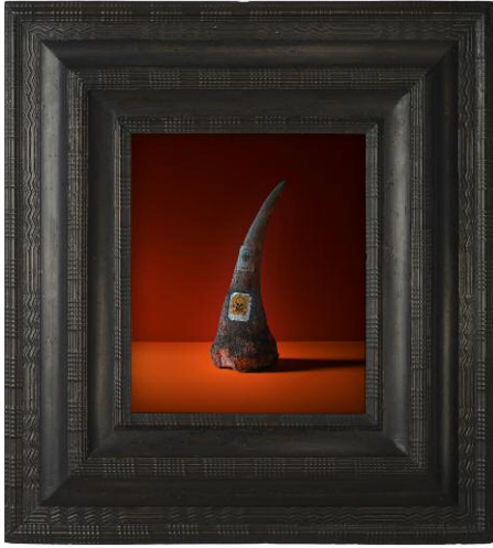
7 © Oliver Mark