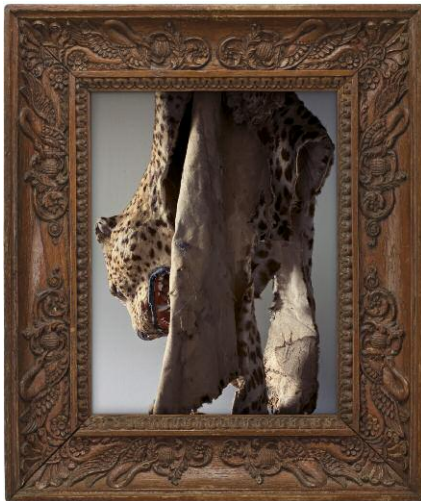
3 © Oliver Mark