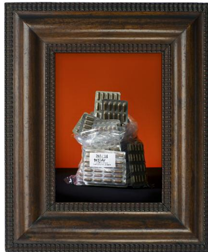
4 © Oliver Mark