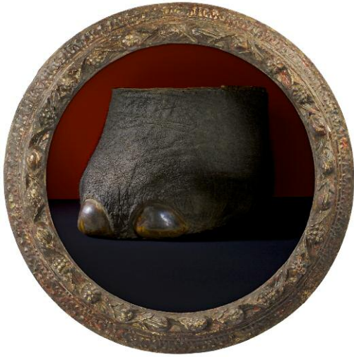
1 © Oliver Mark