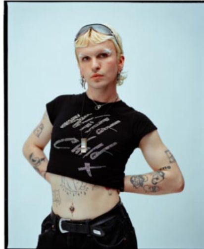
06_ Magor