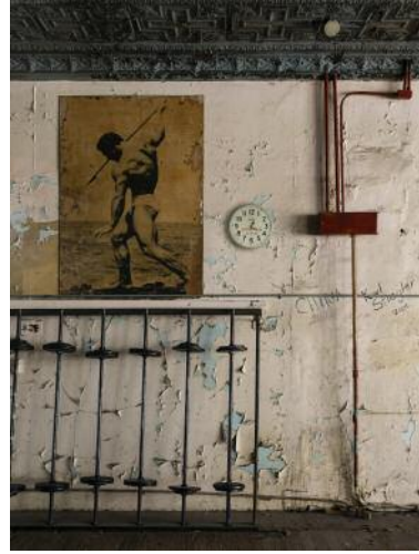
08 West Wall 1 © Norm Diamond