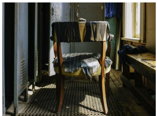
06 Duct Tape Chair © Norm Diamond