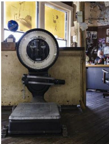
11 Toledo Scale