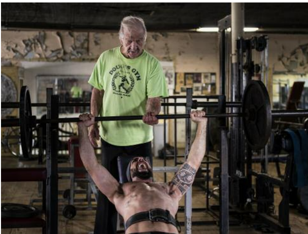
03 Spotting Sauro