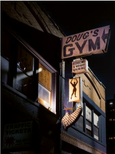
01 Sign No. 1. © Norm Diamond