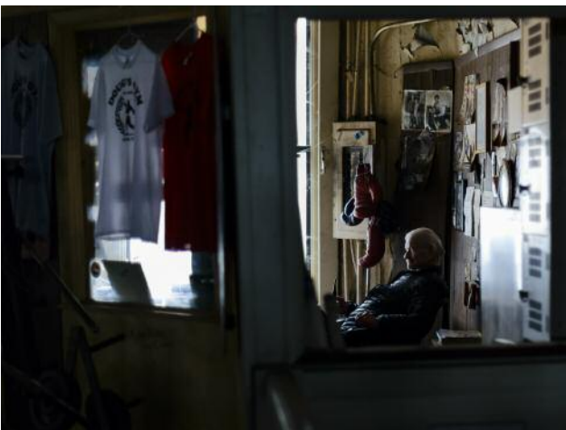
05 Untitled © Norm Diamond