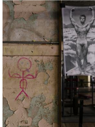
10 West Wall 2