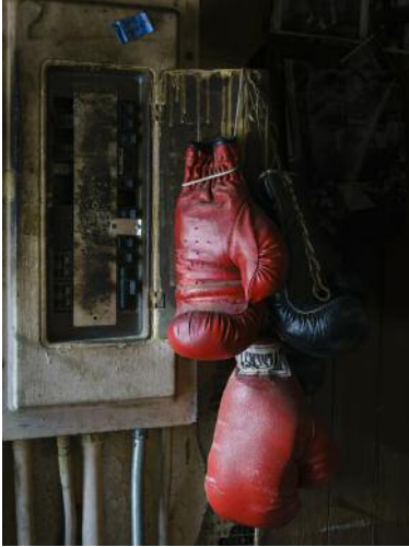
07 Hanging Gloves