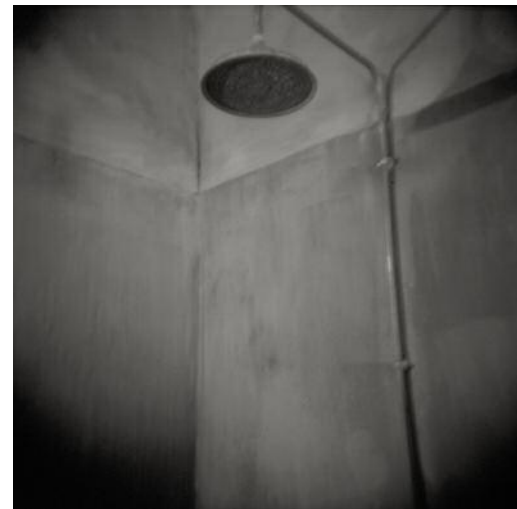
10_ © Øyvind Hjelmen