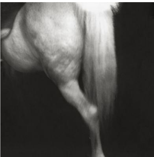
05_ © Øyvind Hjelmen