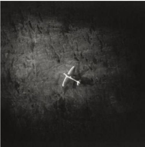
09_ © Øyvind Hjelmen