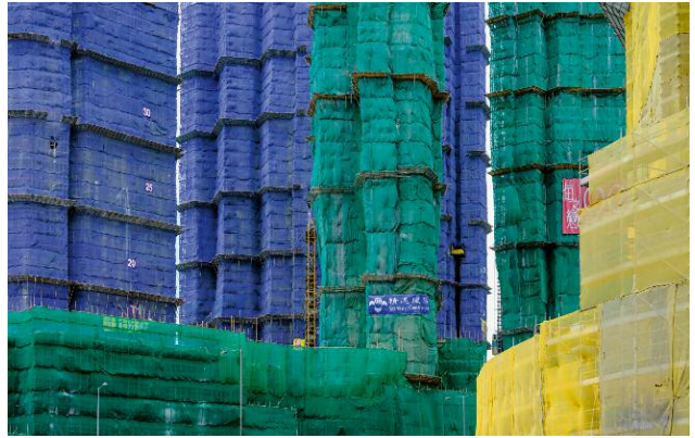
08 © Palani Mohan