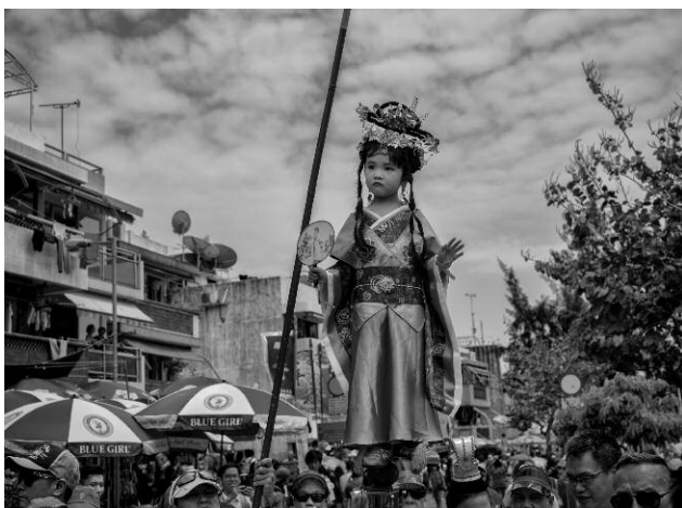
05 © Palani Mohan