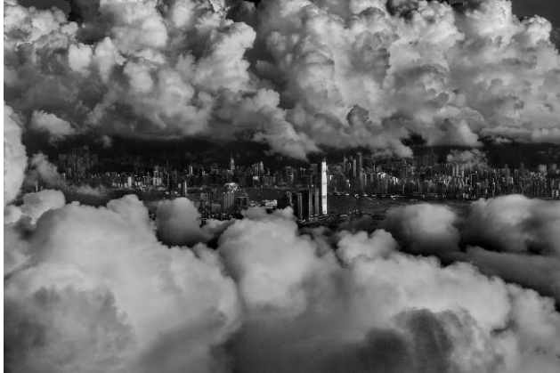
01 © Palani Mohan