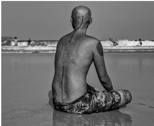
09 © Palani Mohan