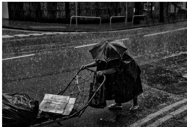
06 © Palani Mohan