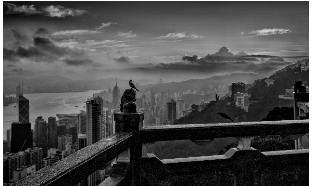
10 © Palani Mohan