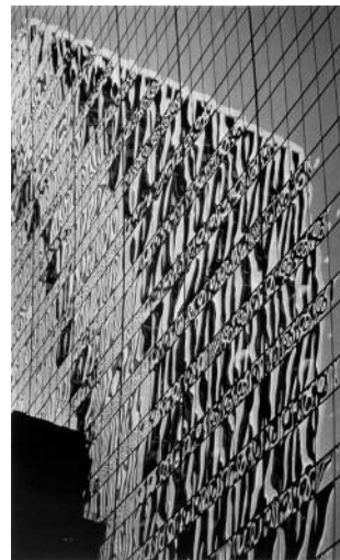
10 Peter Fink, Refractions, New York City, New York, USA, 1975 © VG Bild-Kunst, Bonn, 2020