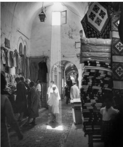
05 Peter Fink, Souk in Tripoli, Libya, 1965