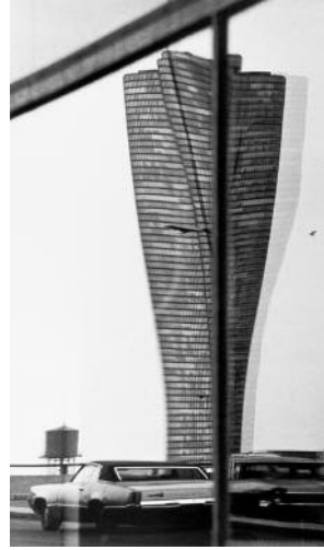
14 Peter Fink, Refractions, Chicago, Illinois, USA, 1970s © VG Bild-Kunst, Bonn, 2020