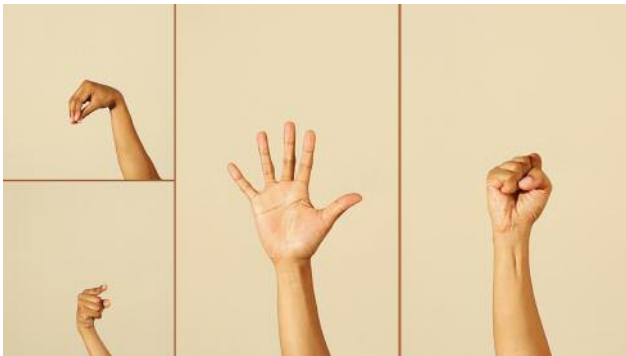
03 - Polyphone | Lerato Shadi: Lerato Shadi, Mabogo Dinku (video still, 1-channel video work, duration: 6 min), 2019