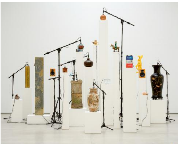
05 - Polyphone | Oliver Beer: Oliver Beer, Household Gods (Grandmother) (16 containers, 2 speakers, 18 columns, audio equipment), 2019