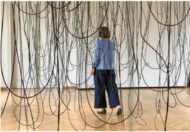
01 - Polyphone | Christina Kubisch: Christina Kubisch, La Serra (14-channel sound installation, 1,600 m electrical cable, induction headphones; installation view), 2017/21