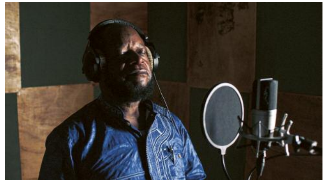
04 - Polyphone | Vincent Meessen: Vincent Meessen, One. Two. Three (3-channel video work, videoloop, Surround Sound), 2015