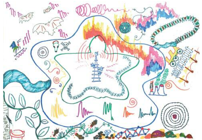
02 - Polyphone | institute for incongruous translation: institute for incongruous translation (Natascha Sadr Haghighian & Ashkan Sepahvand), Carbon Theater Act III Dark Loops , 2020 © Natascha Sadr Haghighian and Ashkan Sepahvand