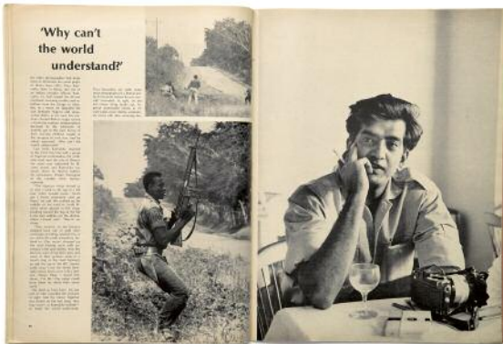
15 Obituary in Life Magazine, Life, 11 October 1968