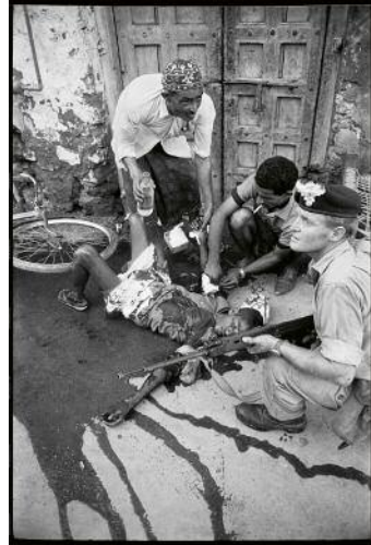
8 British attack, Aden, Yemen, April 1967