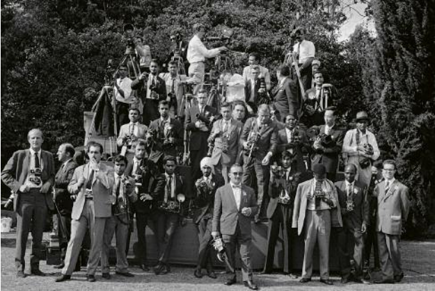
13 International press corps, Independence Day, 12 December, Nairobi, Kenya, 1963 © Priya Ramrakha