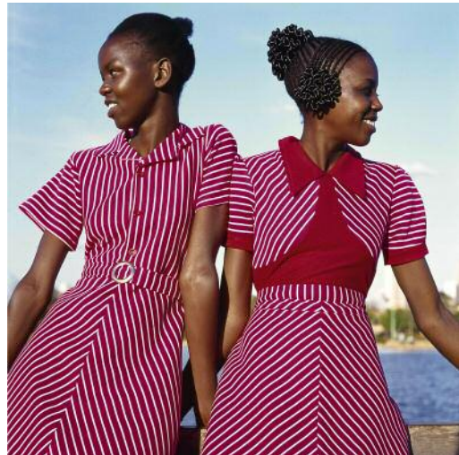
10 Fashion shoot for Raymonds clothing, Nairobi, Kenya, 1967