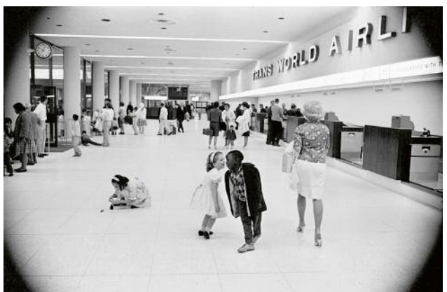
12 Children playing, TWA terminal, Los Angeles, USA, c. 1960