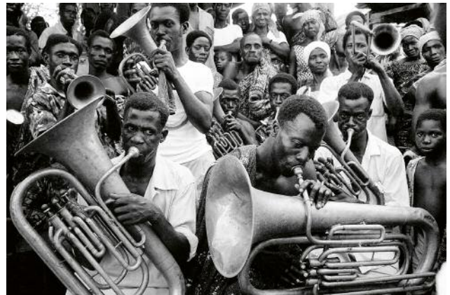
4 Musicians and singers, Accra, Ghana, 1966