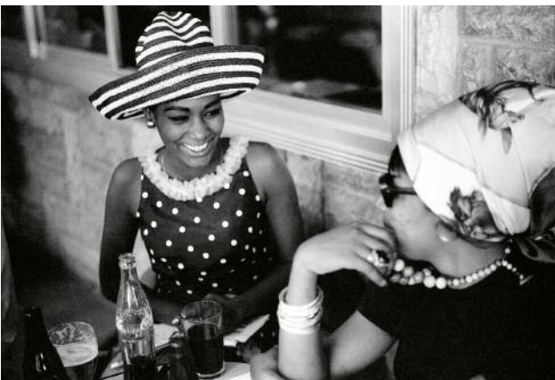
5 Women, Democratic Republic of Congo, 1964