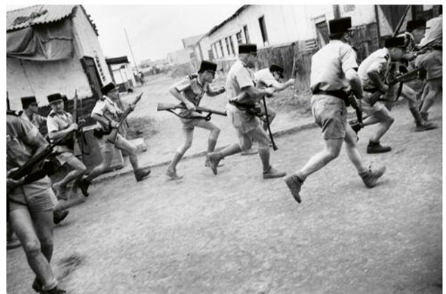
6 French soldiers battle rioters during the French Somaliland independence referendum, March 1967