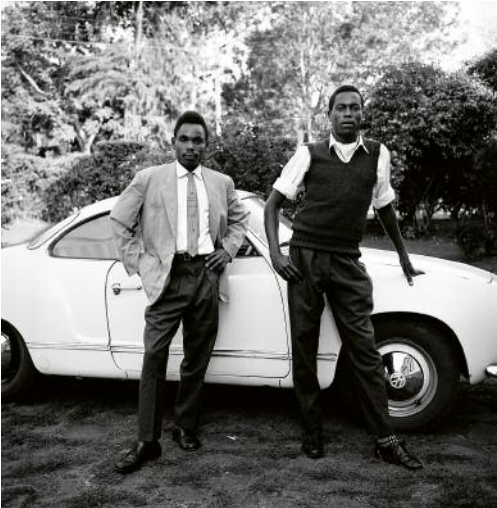
9 Fashion shoot for Raymonds clothing, Nairobi, Kenya, 1967