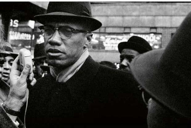
Malcolm X and Nation of Islam protestors, New York, USA, 1960