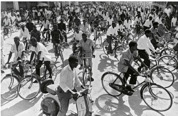
3 Bicyclists, Dar es Salaam, Tanzania, c. 1964