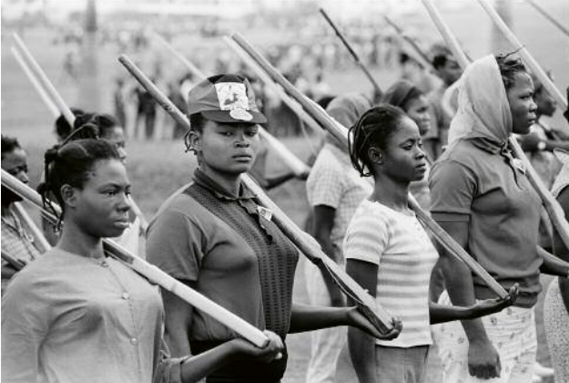
1 Women and men volunteers training as Biafra troops, Enugu, Nigeria, c. 1967