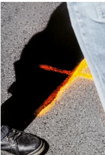
17_Ralph Gibson, from the series The Vertical Horizon , 2016 – 2021