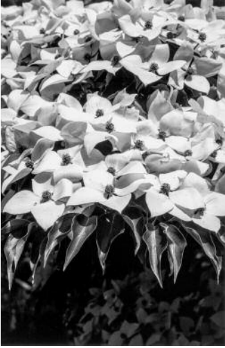
19_Ralph Gibson, from the series Nature/Object , 2015 – 2022 © Ralph Gibson