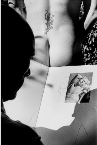
01_Ralph Gibson, from the series Infanta , 2010