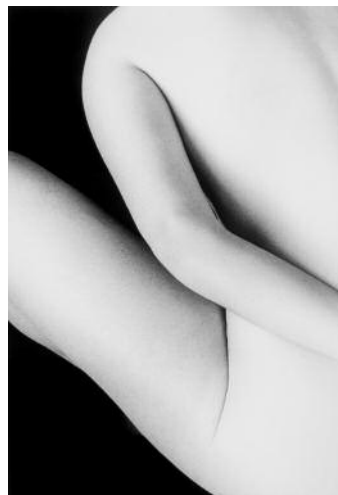
12_Ralph Gibson, from the series Nudes , 1968–2005