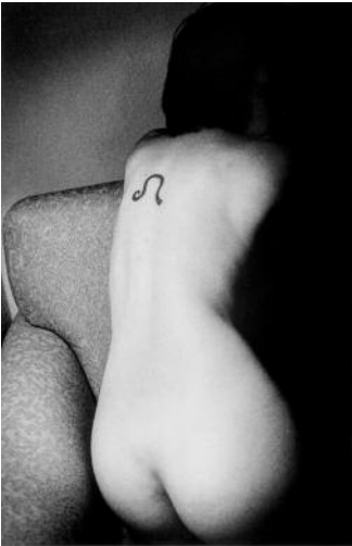
13_Ralph Gibson, from the series Nudes , 1968 – 2005 © Ralph Gibson