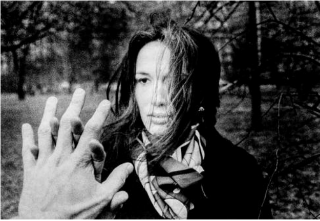
07_Ralph Gibson, from the series The Somnambulist , 1970