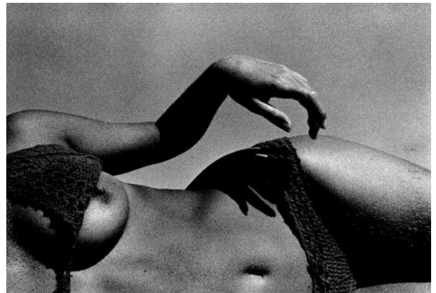
04_Ralph Gibson, from the series Days at Sea , 1974 © Ralph Gibson