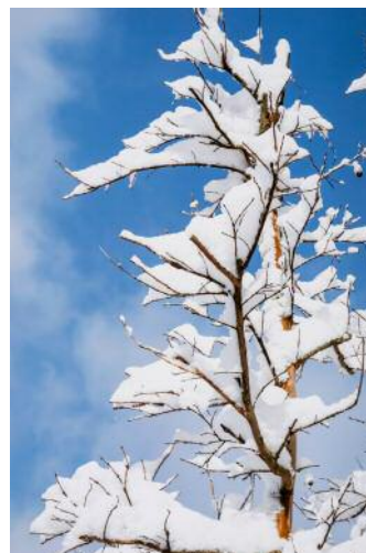
18_Ralph Gibson, from the series Nature/Object , 2015 – 2022 © Ralph Gibson