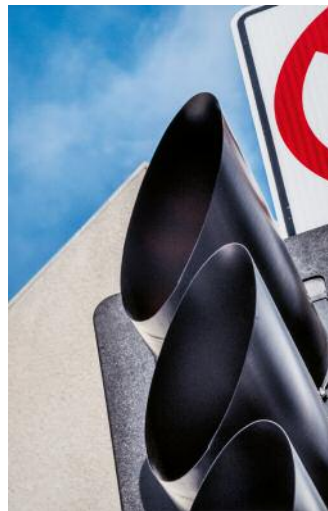
16_Ralph Gibson, from the series The Vertical Horizon , 2016 – 2021 © Ralph Gibson