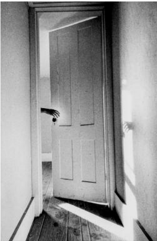
09_Ralph Gibson, from the series The Somnambulist , 1970