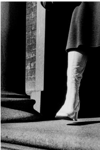
03_Ralph Gibson, from the series Days at Sea , 1974