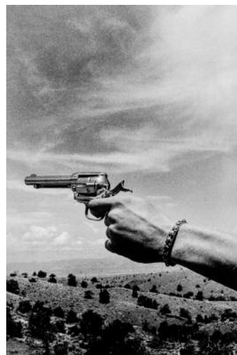
06_Ralph Gibson, from the series Deja-Vu , 1972