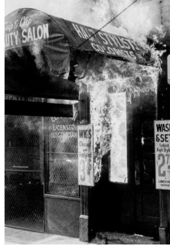
08_Ralph Gibson, from the series The Somnambulist , 1970 © Ralph Gibson