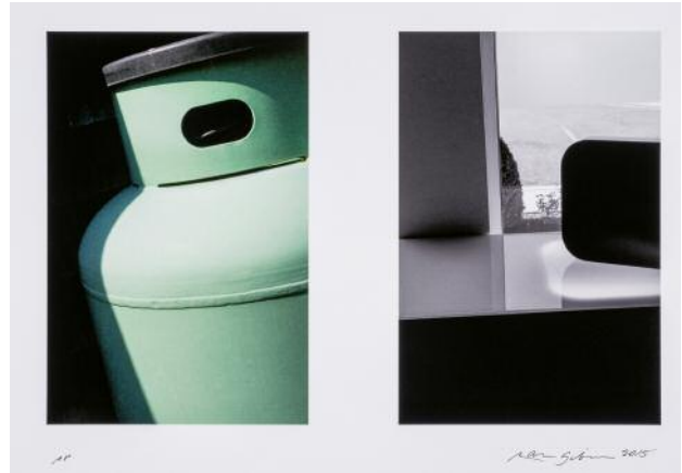
14_Ralph Gibson, from the series Political Abstraction , 2015 © Ralph Gibson