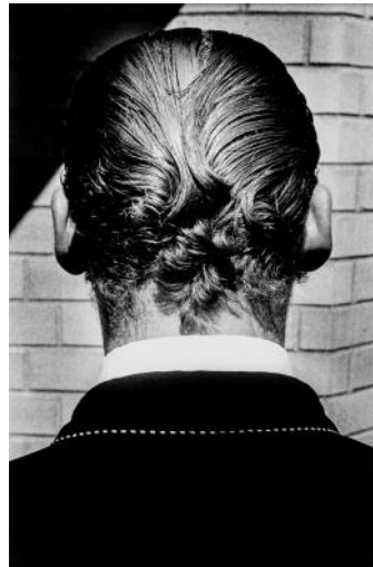
10_Ralph Gibson, from the series Quadrants , 1975–1988