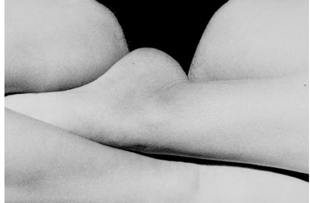
02_Ralph Gibson, from the series Days at Sea , 1974