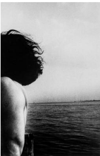
05_Ralph Gibson, from the series Deja-Vu , 1972