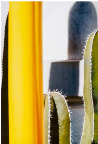
15_Ralph Gibson, from the series The Vertical Horizon , 2016 – 2021 © Ralph Gibson