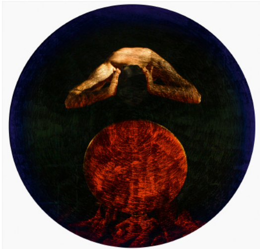
7. Somnium (2013–2017). Video Stil © Joe Ramirez