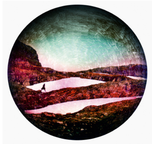
8. Somnium (2013–2017). Video Stil