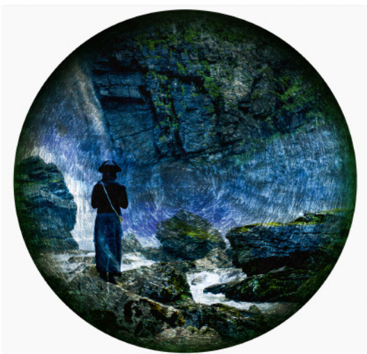
5. Somnium (2013–2017). Video Stil © Joe Ramirez