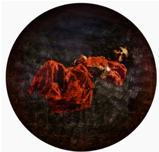
10. Somnium (2013–2017). Video Stil