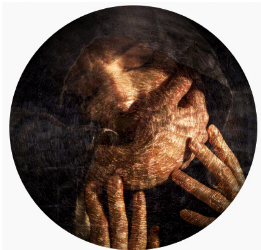
12. Somnium (2013–2017). Video Stil