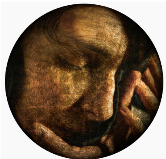
11. Somnium (2013–2017). Video Stil