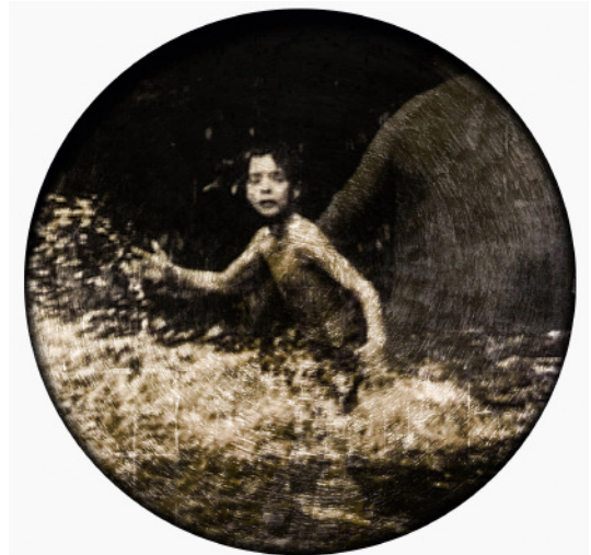
2. Ropcutter, 2015. Video Still