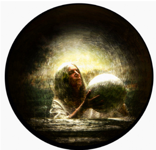
9. Somnium (2013–2017). Video Stil © Joe Ramirez