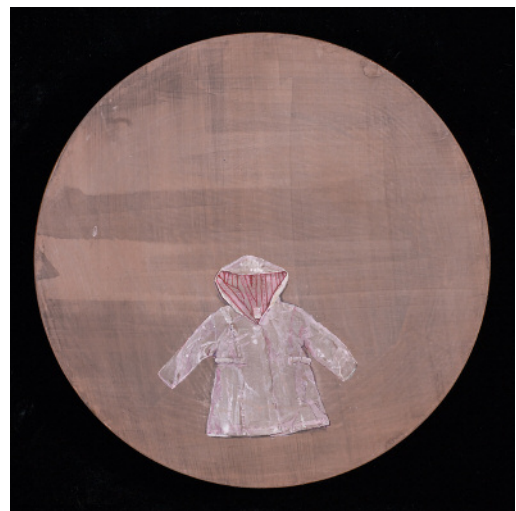
4. The Magic Dress, 2015. Silverpoint and tempera, Ø 50 cm © Joe Ramirez