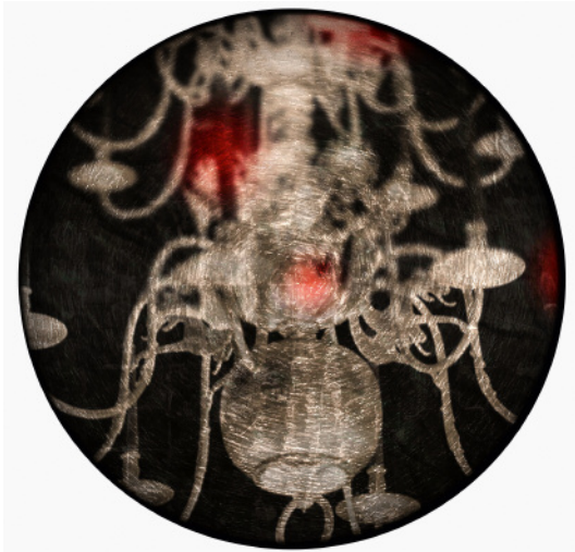
1. Orphée, 2014. Video Still