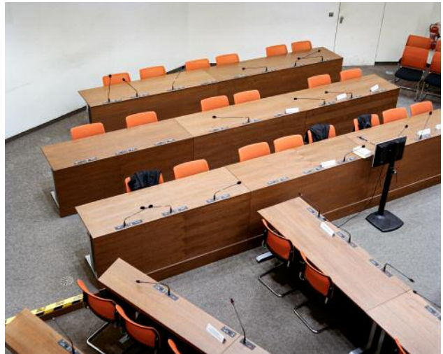
04_Paula Markert: Anklagebank, Schwurgerichtssaal 101, Oberlandesgericht München , from the series Eine Reise durch Deutschland. Die Mordserie des NSU , 2014–2017 © Paula Markert