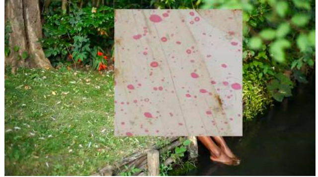
08_Ja'Tovia Gary, The Giverny Suite , 2019 © Ja'Tovia Gary, Courtesy Paula Cooper Gallery