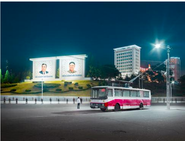
03_Eddo Hartmann: Trolley Bus, Somun Street, Pyongyang , from the series Setting the Stage, Pyongyang, North Korea , 2014–2017