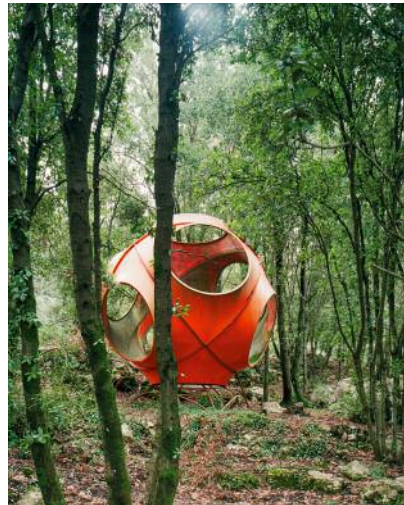
02_Johanna Diehl: LO VAG XII (Prototype/Forêt) , 2013, from the series Eurotopians