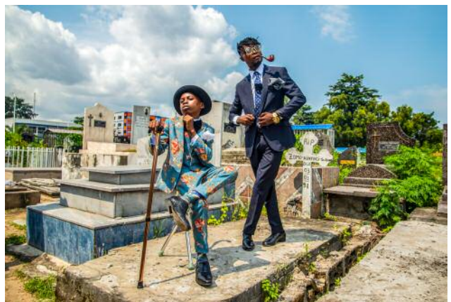
12_Yves Sambu: À l'ombre de mon père , from the series Vanitas project , 2010–2017