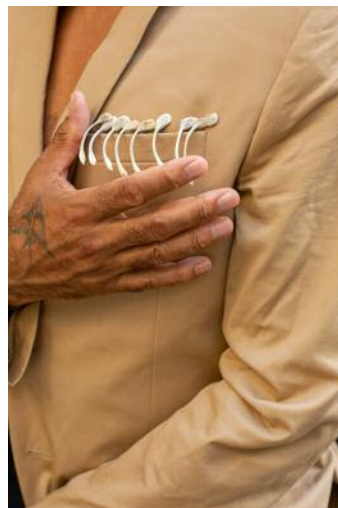
10_Qiana Mestrich: The Right to Wear War , 2020, from the series Thrall