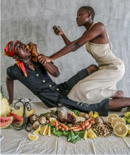
07_Yagazie Emezi, from the series The Consumption of the Black Model , 2018 © Yagazie Emezi