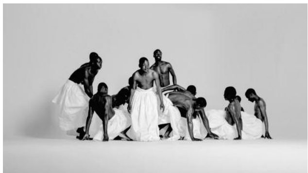
06_Mohau Modisakeng: Ga Bose Gangwe , 2013 © Mohau Modisakeng