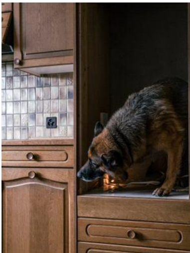
09_Salvatore Vitale: Canine unit's dog looking for drugs , from the series How to Secure a Country , 2014–2018 © Salvatore Vitale