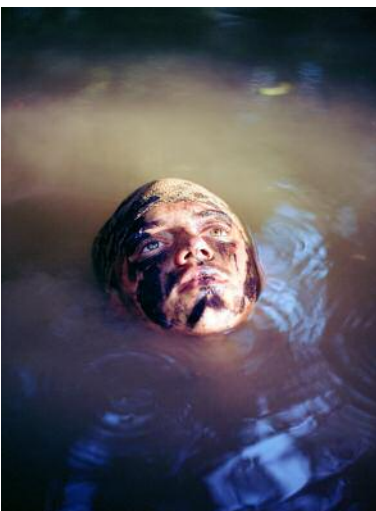
11_Máté Bartha: Kontakt XXXV , from the series Kontakt , 2018 © Máté Bartha