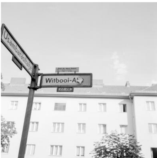
05_Akinbode Akinbiyi: Berlin, Wedding , 2005, from the series African Quarter © Akinbode Akinbiyi