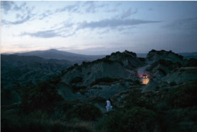
7 Aliano, Basilicata