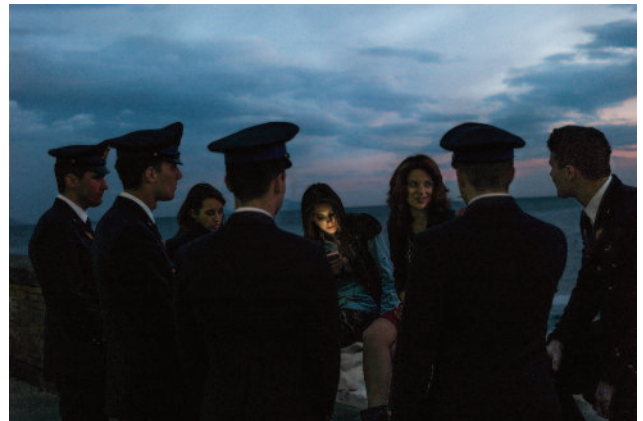
10 Naples, Campania