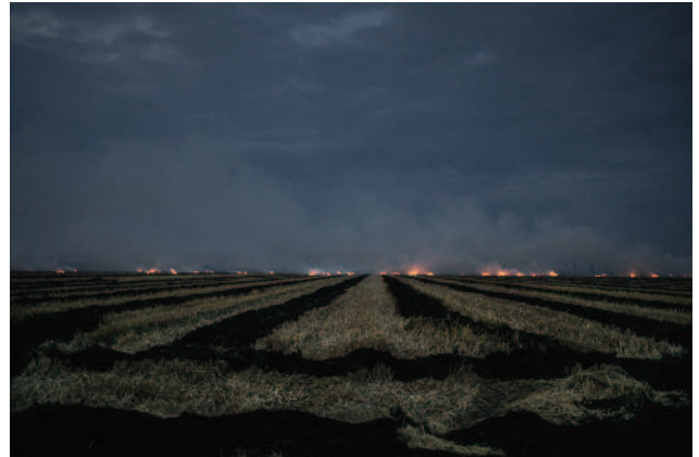
8 Scardovari, Veneto