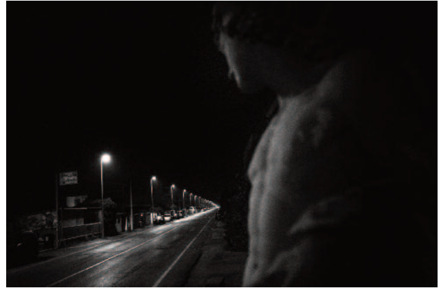
2 Torvaianica, Lazio © Giulio Rimondi