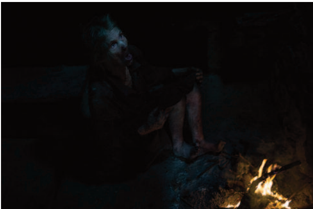
3 Aspromonte, Calabria © Giulio Rimondi