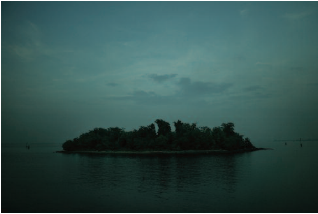
1 Venice, Veneto