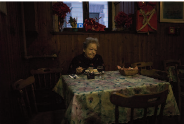
5 Trieste, Friuli Venezia Giulia © Giulio Rimondi