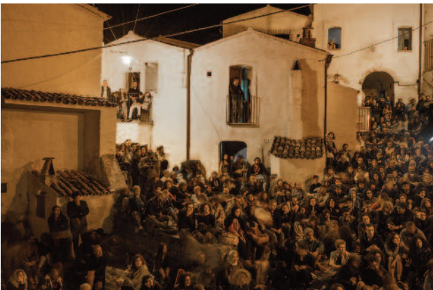
9 Aliano, Basilicata