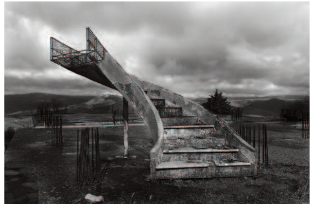
4 Irpinia, Campania © Giulio Rimondi