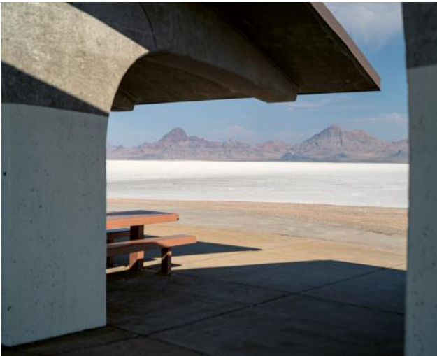
09_Bonneville, Utah