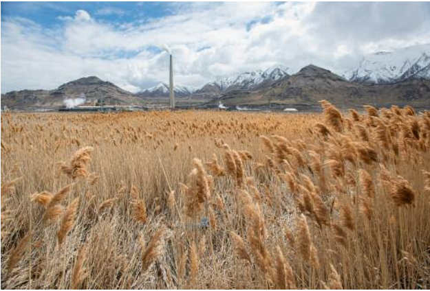
07_Arthur, Utah