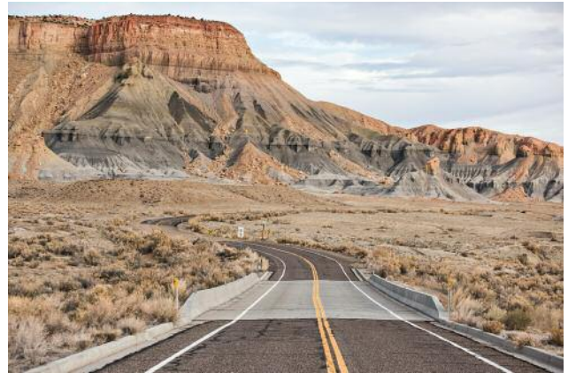
02_Emery, Utah © Rob Hammer