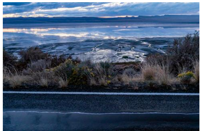
6_Valley Falls, Oregon