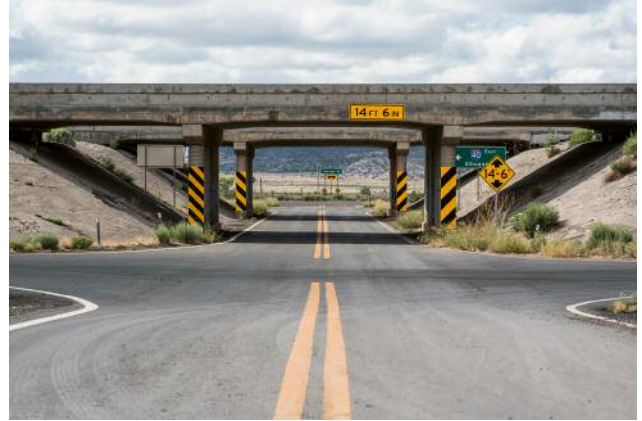
08_Houck, Arizona