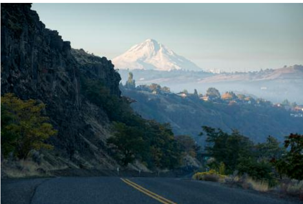
05_The Dalles, Oregon