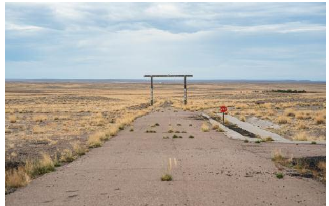
10_Sun Valley, Arizona