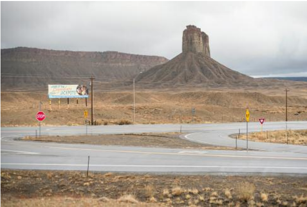
01_Towaoc, Colorado