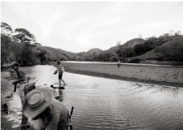
11_ In FPL territory, guerrillas cross a river near the Salvadoran-Honduran border. Department of Chalatenango, February 1981