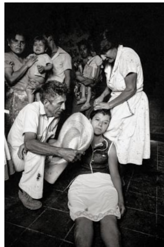
06 The sister of one of the victims faints upon hearing of his death. Santa Clara, July 1982