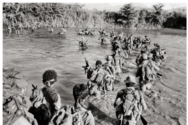
04 Members of the Atlacatl Battalion cross a river during a counterinsurgency operation. Department of San Miguel, September 1983