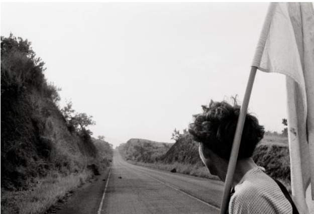
03 A Salvadoran journalist displays a white flag to show FPL guerrillas that he travels in peace on the Pan American Highway. Department of San Vicente, June 1983