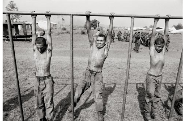
08_ Salvadoran Army recruits take part in a training exercise overseen by U.S. Army Rangers and Special Forces at a Salvadoran Air Force base. Ilopango Airport, San Salvador, March 1983