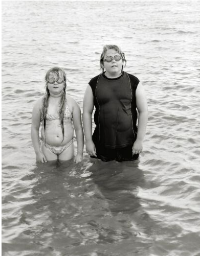
7 Canvey Island