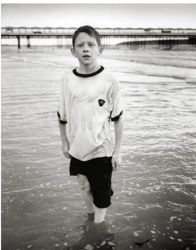
11 Blackpool