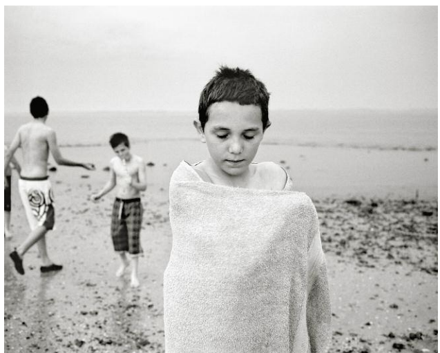
12 Canvey Island © Sheila Rock