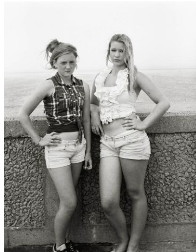
8 Leysdown - On - Sea