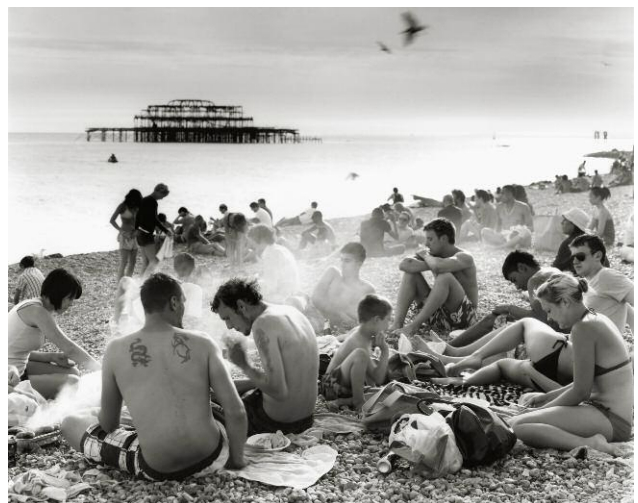
6 Brighton