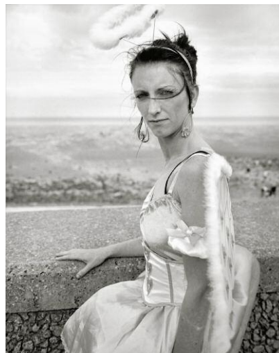
10 Leysdown - On - Sea