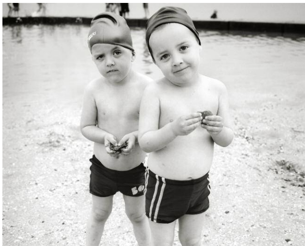
3 Canvey Island