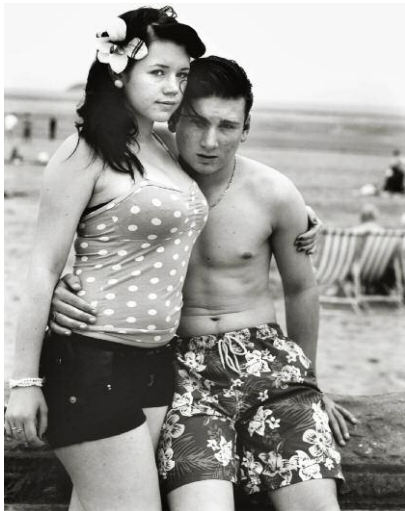
1 Weston - Super - Mare © Sheila Rock