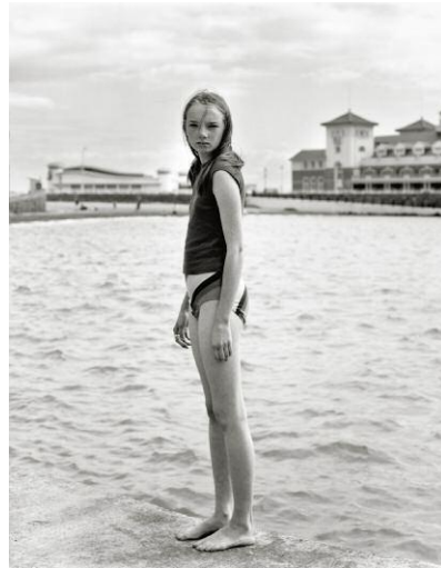
2 Weston-Super-Mare