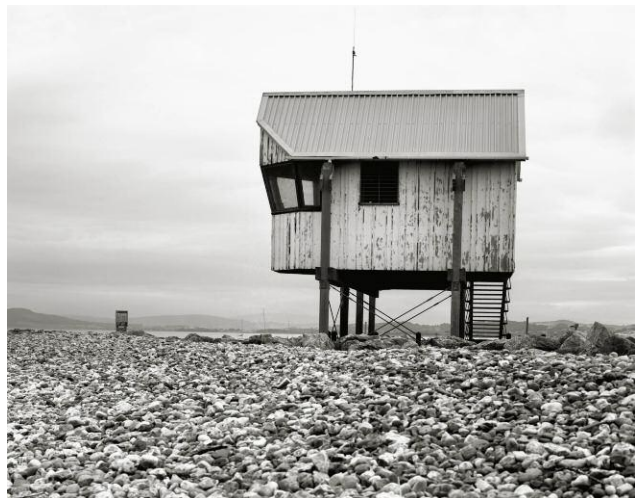
4 Morecambe