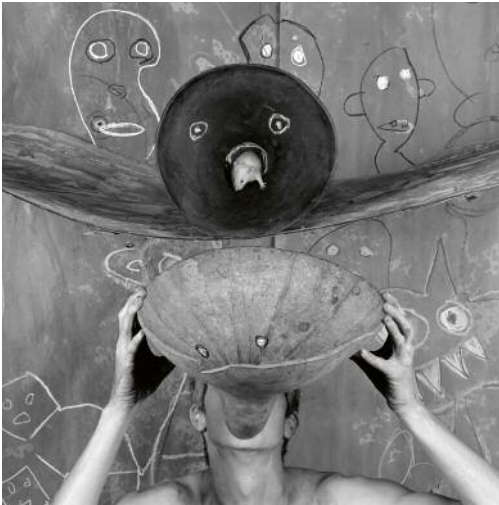
01_Roger Ballen, Mouth to Mouth, 2013 © courtesy Roger Ballen