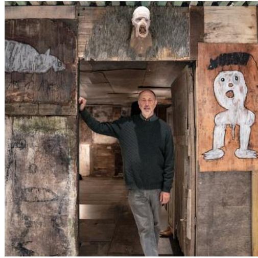
o8_Roger Ballen in the exhibition Roger Ballen. Call of the Void , Museum Tinguely, Basel, 2023