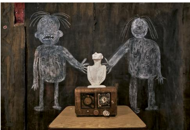
05_Installation view of the exhibition Roger Ballen. Call of the Void , Museum Tinguely, Basel, 2023