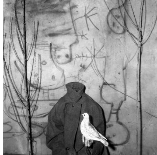
02_Roger Ballen, Headless, 2006 © courtesy Roger Ballen