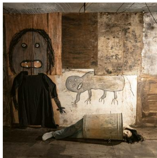
06_Installation view of the exhibition Roger Ballen. Call of the Void , Museum Tinguely, Basel, 2023 © courtesy Roger Ballen Photos Daniel Spehr © Museum Tinguely