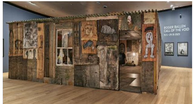
04_Installation view of the exhibition Roger Ballen. Call of the Void , Museum Tinguely, Basel, 2023