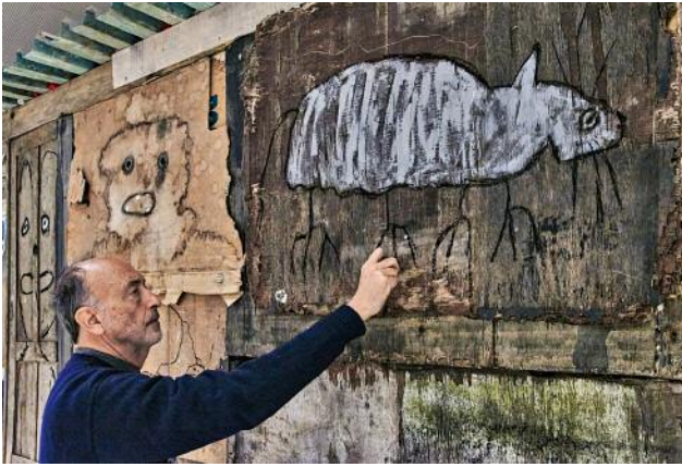
o7_Roger Ballen in the exhibition Roger Ballen. Call of the Void , Museum Tinguely, Basel, 2023