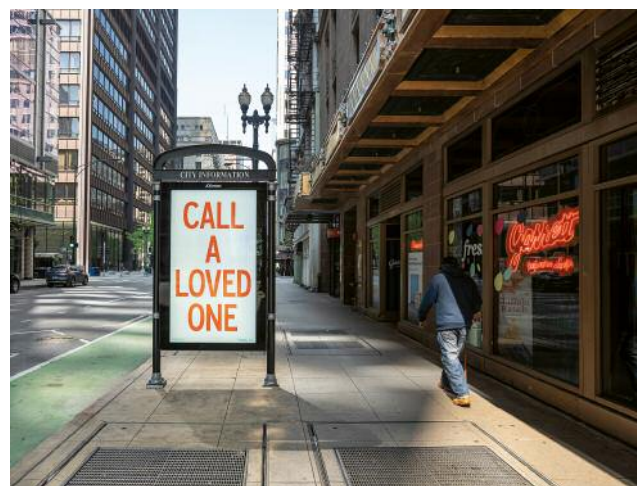
6_The Loop | April