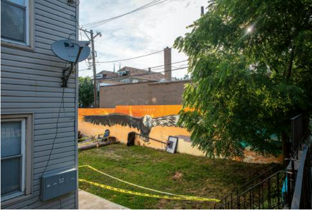
07_Lower West Side | July