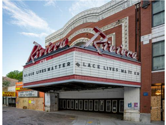
02_Uptown | June