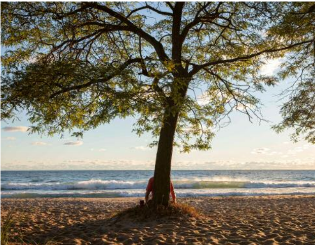
09_Rogers Park | September