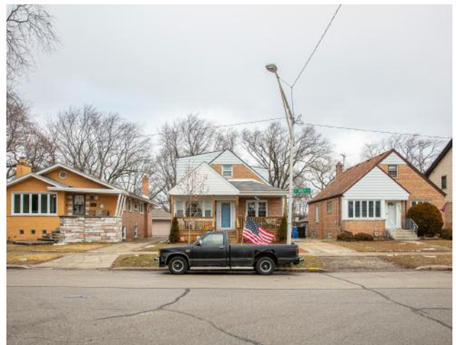
04_February | Mount Greenwood