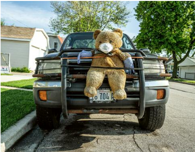
03_Portage Park | May