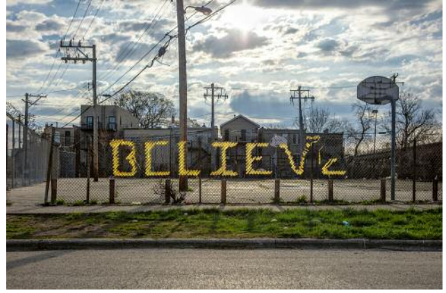
08_North Lawndale | April