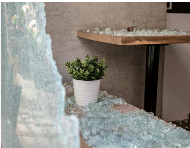
05_The Loop | May