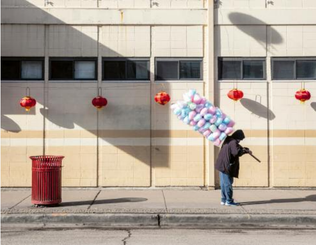
01_Amour Square | February