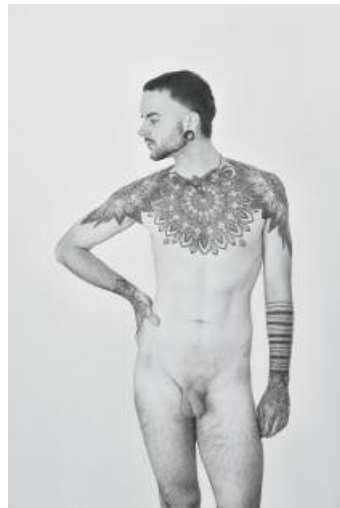
4_Ralph © Ashkan Sahihi