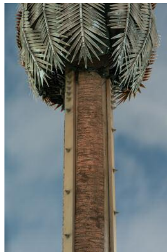
06_