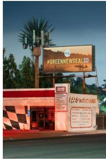
02_