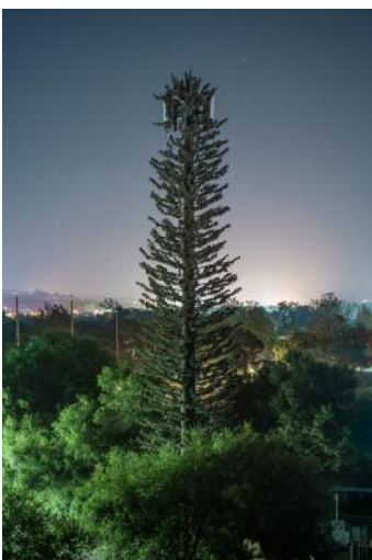
11_