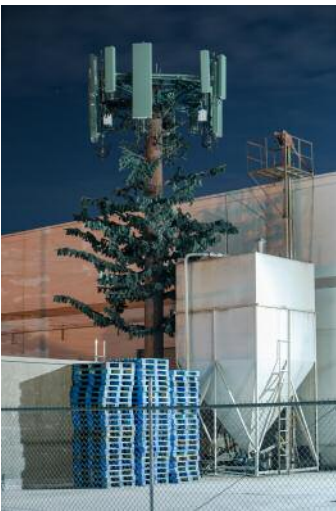
09_