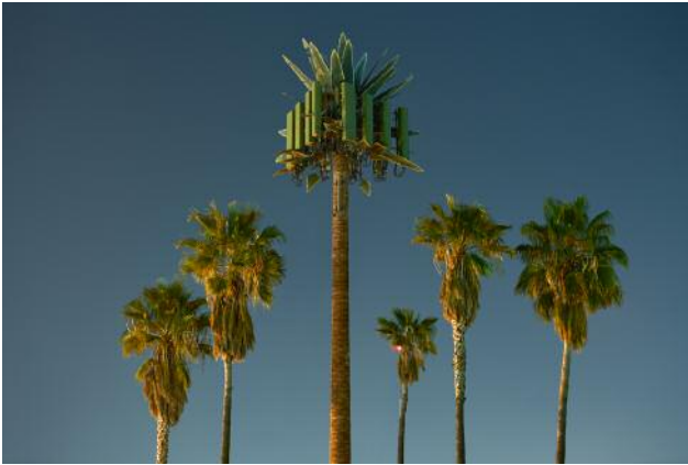
01_