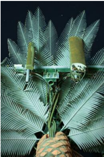
03_