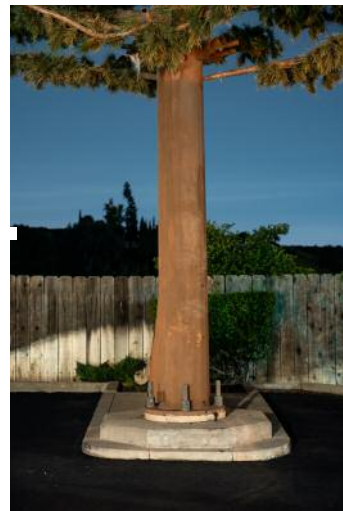
10_