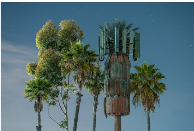
05_