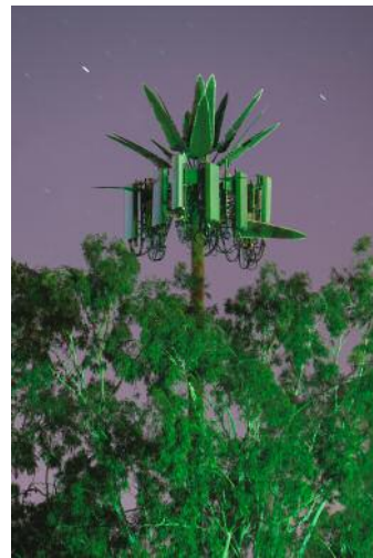
04_ © Işık Kaya