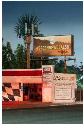
02_ © Işık Kaya