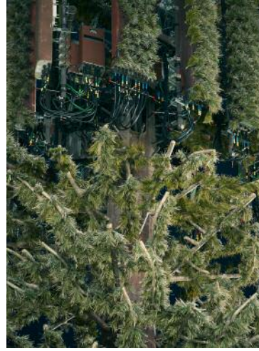
08_ © Işık Kaya