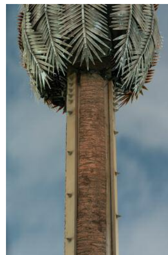
06_ © Işık Kaya