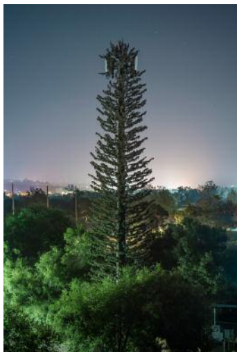
11_ © Işık Kaya