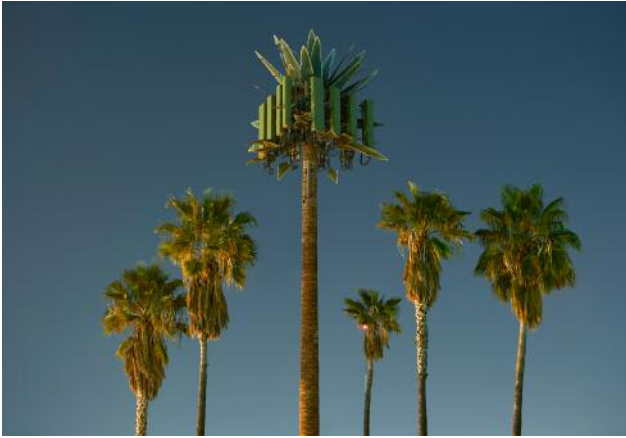
01_ © Işık Kaya