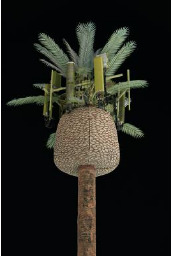
07_ © Işık Kaya