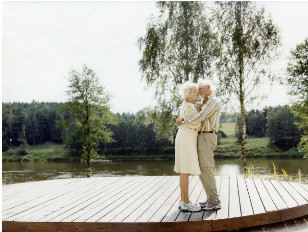
1. At the river Nemunas, Lithuania