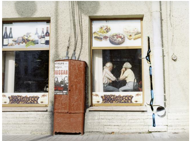
2. Café in St. Petersburg, Russia