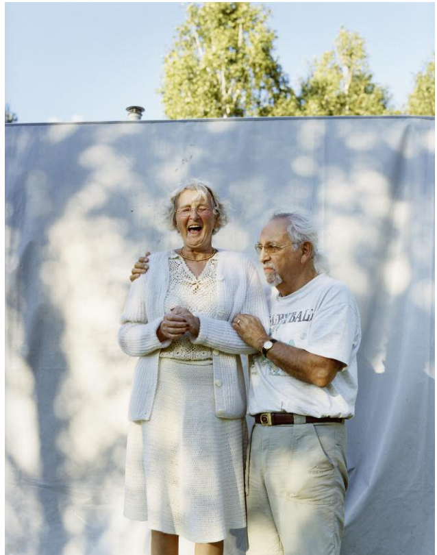
4. Camping site, Harsz, Poland