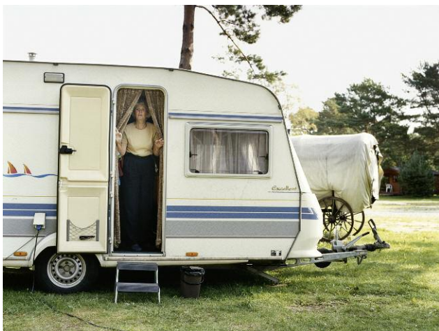
5. Camping site, Kuressaare, Isle Saaremaa, Estonia