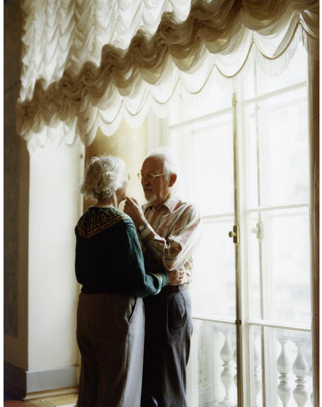
8. Hermitage, Saint Petersburg, Russia