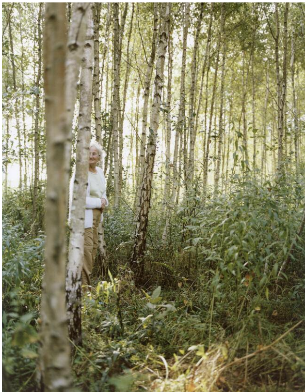
3. Birch forest, Harsz, Poland