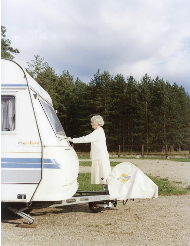
7. Camping site in the national park Ankstaitijos, Lithuania