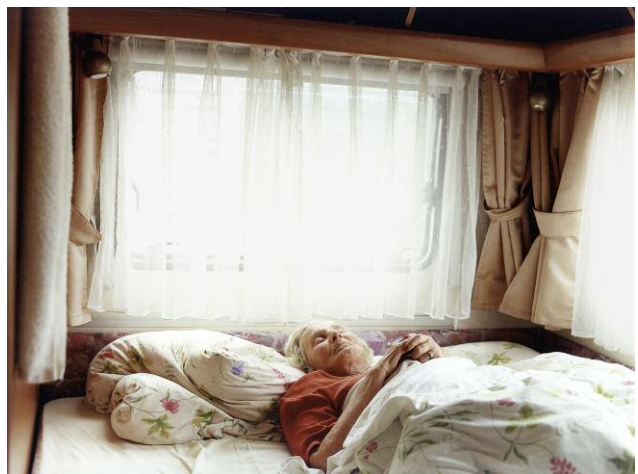
6. Inside Camper