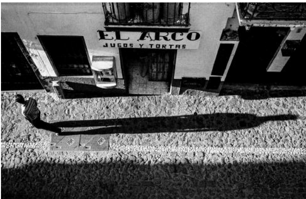
5 Man and Long Shadow from Above, Taxco, 2009