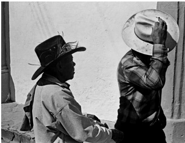
3 Two Men Wearing Sombreros, Atotonilco, 1997 © Harvey Stein