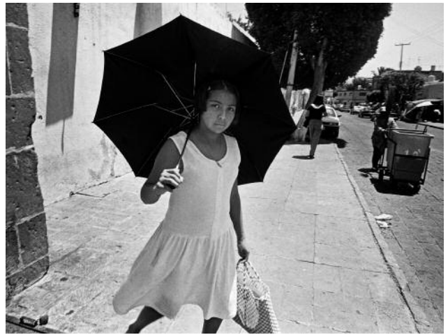
12 Young Woman Holding Umbrella, Querétaro, 1999