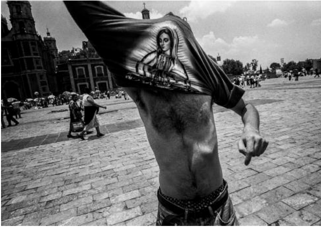
7 Man Putting on Guadalupe Shirt, Mexico City, 2000