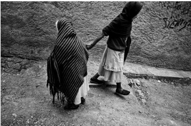
11 Two Women Passing Each Other, San Miguel de Allende, 1993