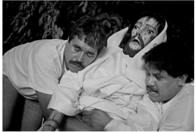
8 Holding Jesus, Taxco, 2003