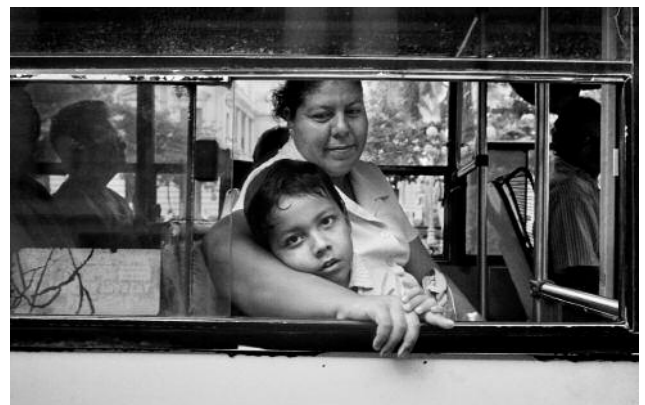
6 Woman and Child on Bus, Veracruz, 2007