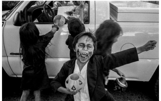
10 Boy with Outstretched Arm and Pumpkin, Morelia, 1999