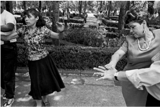
1 Two Couples Dancing the Danzón, Mexico City, 2000