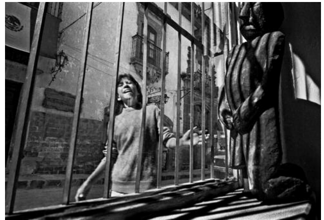
2 Woman Outside Window, San Miguel de Allende, 1995