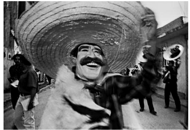
4 Man in President Fox Mask and Sombrero, Etna, 2001