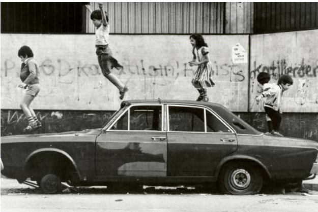
15_ Berlin, Kreuzberg, Dresdener Straße , 1980