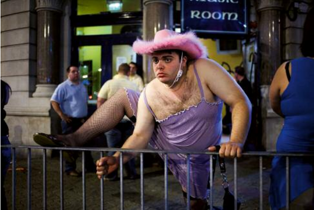
1_ Ohne Titel , 25. Juni 2006 Aus der Serie Cardiff After Dark , 2005–2011