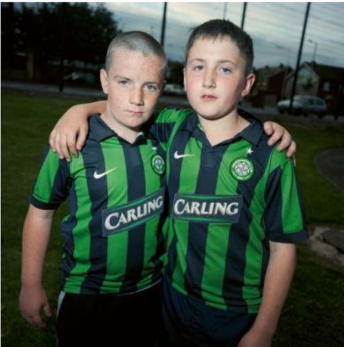
3_ New Lodge boys #9 Aus der Serie Playing Belfast , 2007–2009