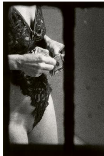
10_Dirty Windows #5, New York City, 1994 Aus der Serie Dirty Windows , 1993–1994