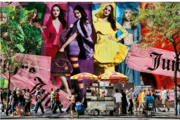
11_Juicy Couture 01, 2008 Aus der Serie Coming Soon , 2008–2014 © Natan Dvir