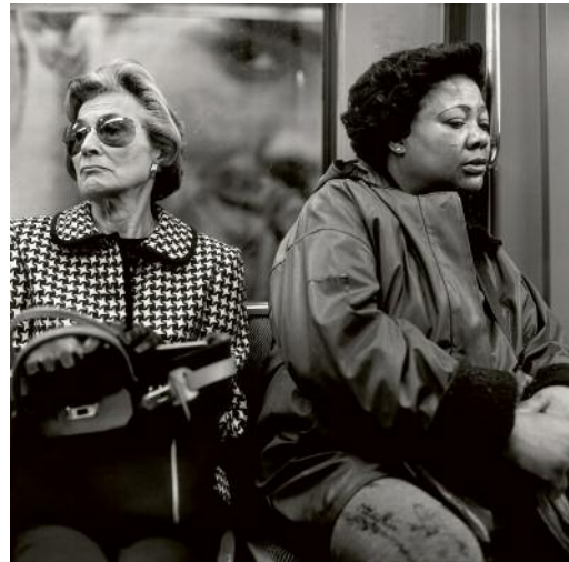
4_ Poo1 Paris 04.2005 , April 2005 Aus der Serie Under Ground , 2005–2006