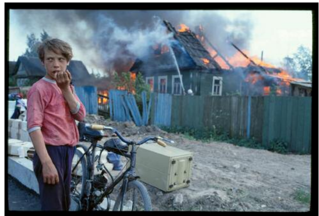
12_Ohne Titel aus der Serie Feuer, Novgorod , 1993