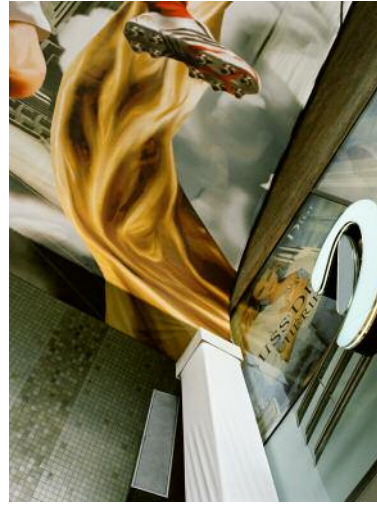
8_Ohne Titel Aus dem Buch Catch , 2015