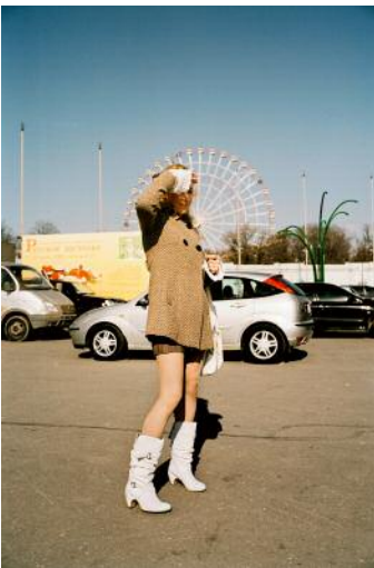
9_Girl Aus der Serie Moscow Street , 2008