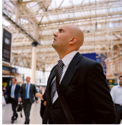
14_ Untitled Aus der Serie Behold , 2009–2011