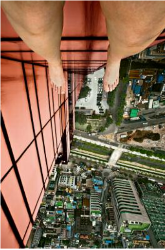
13_ Self-Portrait , 2009