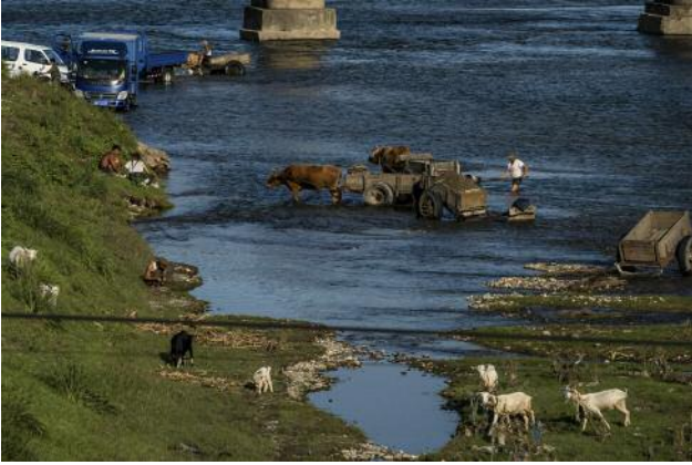
07_ People wash cars and collect gravel at a riverbank on the road between Ulim Waterfalls and Hamhung in the country's east.