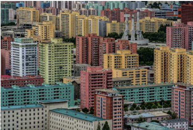
09_ City view taken from the Tower of Juche Idea, Pyongyang. The Monument to Party Founding, top right of the image, portrays a worker, a farmer, and an intellectual holding hammer, sickle, and brush, respectively.