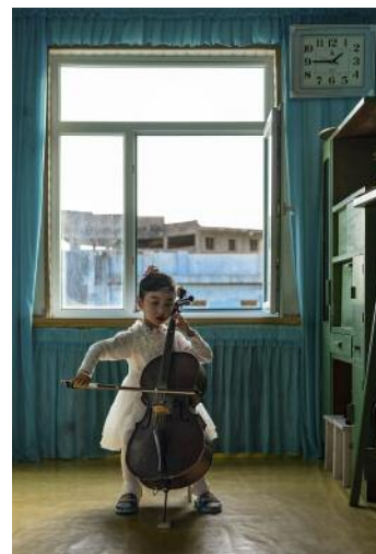
12_ Girl plays a cello at Chongam Kindergarten, Chongjin.