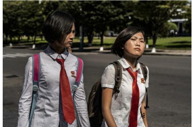
10_ School girls. Pyongyang.