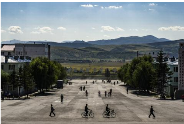
05_ Street scenes of Hoeryong as seen from the monument of Kim Jong Suk.