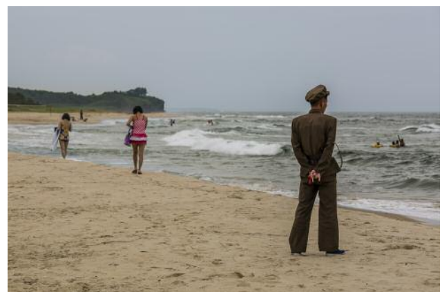
06_ Man in military uniform watches over beachgoers near Wonsan.