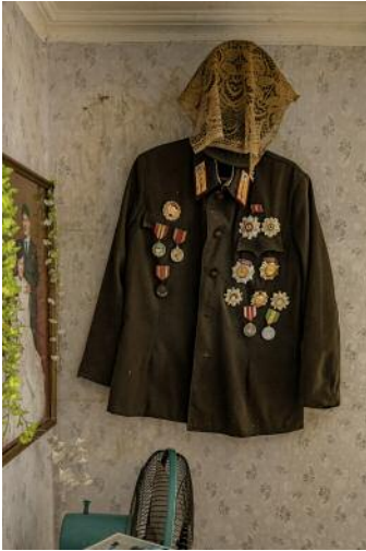
01_ A coat adorned with medals hangs in a home. Migok Cooperative Farm, Sariwon.