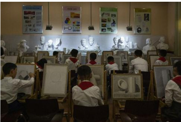
11_ Drawing class at the Mangyongdae Schoolchildren's Palace in Pyongyang, the largest facility for children's after-school activities in North Korea.