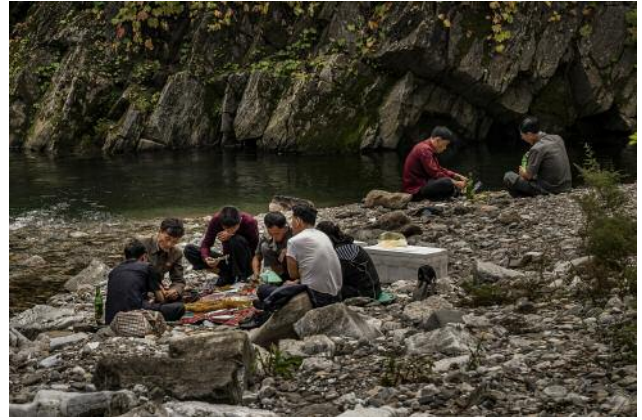
08_ People have a picnic near the Ulim Waterfalls, named after the Korean word for echo, as its rumbling sound resonates across a four-kilometre radius.