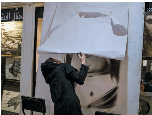
5. A young woman tries to sneak a peek of a drawing of a woman covered by white paper in Qaem Mall, under Iran's Islamic laws showing women's bodies in public is forbidden.