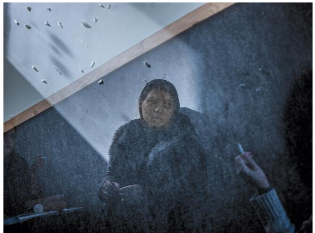
4. Girls smoking in a hallway of the university during a break.