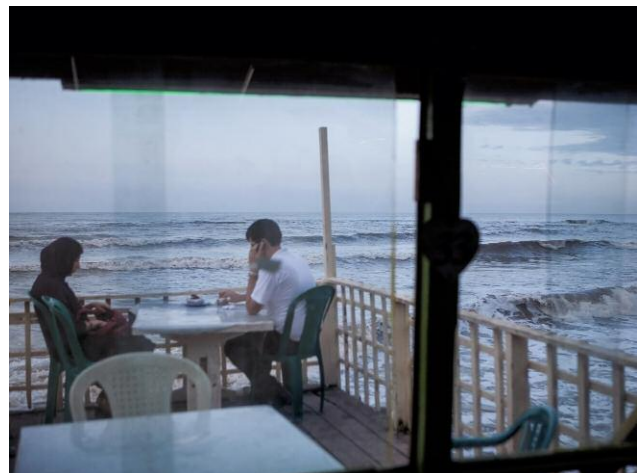
10. A couple sitting by the sea.