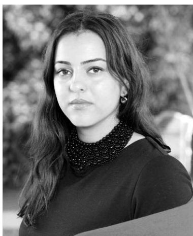
Portrait of Newsha Tavakolian for the Carmignac Foundation

Please note: These photographs have been copyright cleared for worldwide print and electronic reproduction in the context of reviews of the book only. No more than THREE photographs plus the cover image from the selection can be used in total – they are not to be used on the cover or cropped.