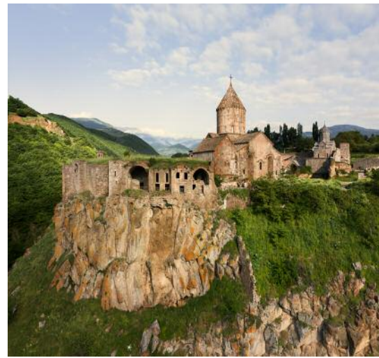
10_TATEV MONASTERY / Syunik Province, 9th–17th century