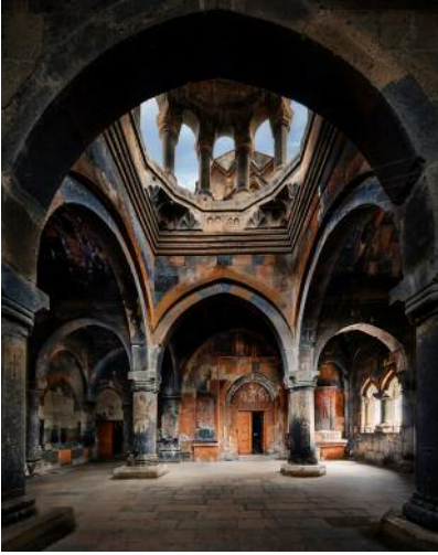
07_HOVHANNAVANK MONASTERY / Aragatsotn Province, 4th–13th century