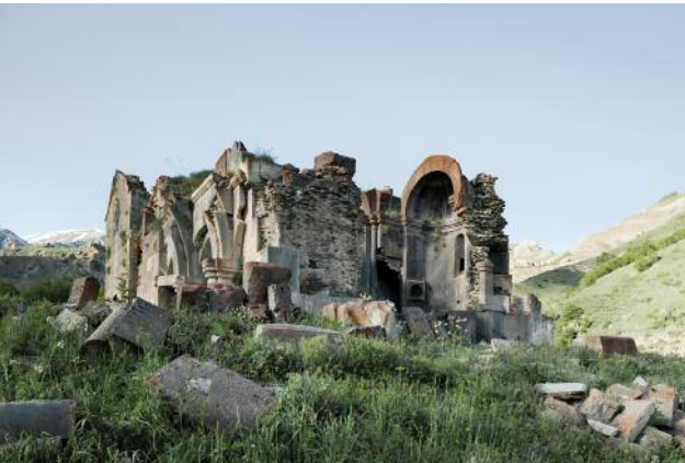
09_ARATES MONASTERY / Vayots Dzor Province, 9th–13th century © Ted & Nune